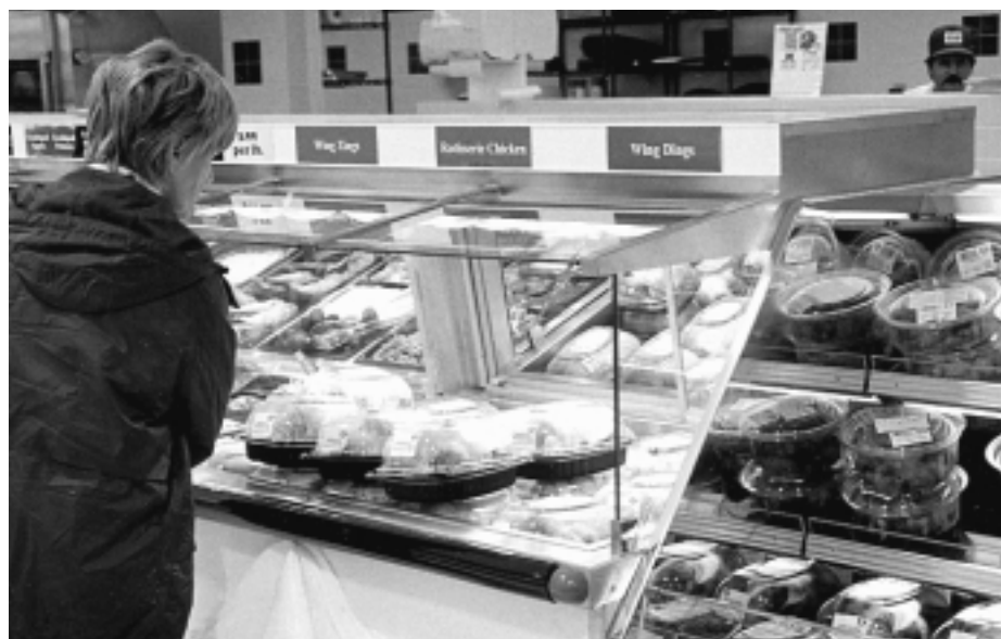
The volume and variety of prepared foods offered by grocery stores boosted employment and labor costs for food stores over the last decade.

Consumer food expenditures can be separated into two broad components—marketing costs and the farm value. Marketing costs accounted for 80 percent of total consumer food spending, with the farm value comprising the remaining 20 percent. Higher marketing costs were the primary cause of ris-