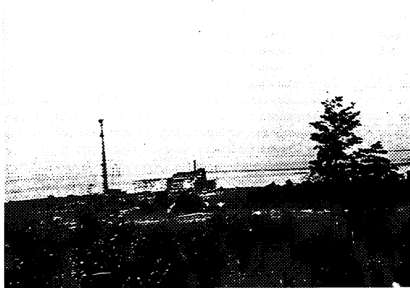
First Western Picture of Obninsk Plant

In 1954 the Russians publicized the initial operation of the first atomic power station in the world at Obninsk (the variant name used for the town served by Obnino station).