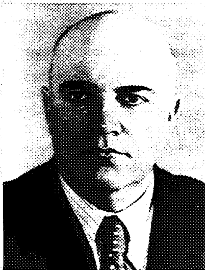
A. P. ZAVENYAGIN