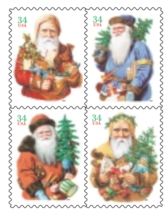
Holiday stamps issued this month feature images of Santa Claus.

Replacing the readers will reduce operating costs and improve reader performance as well as increase the quality of delivery point sequenced mail. The system will also support revenue protection initiatives, enhance development of the Information Platform and help establish new technology initiatives.