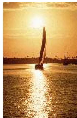
Newport Harbor at Sunset

Orange County's John Wayne Airport is just 5 miles away from the hotel, and the hotel provides complimentary transportation to and from the airport. Los Angeles International Airport (LAX) is an alternative airport located approximately 40 miles away. Discounted group shuttle service from LAX to the hotel will be available for conference participants. Please see our website for details.