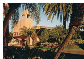
The Hyatt Regency Newporter