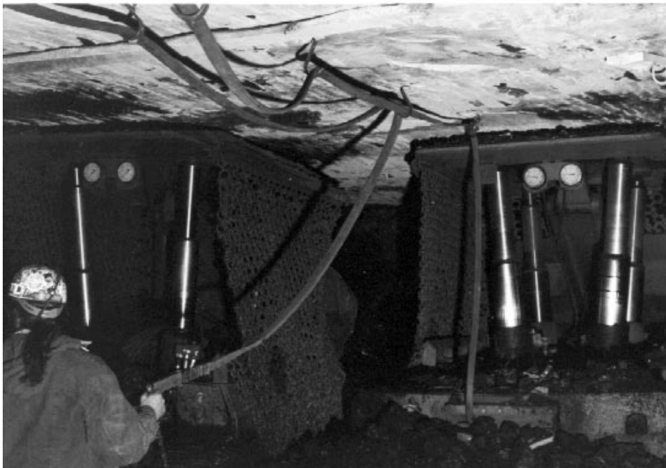
Figure 3.—Full pillar extraction using mobile roof supports.