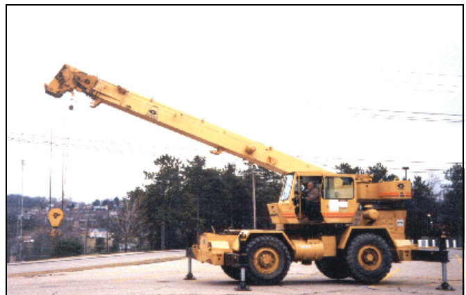
Fig. 3. 20 tonne (22 short ton) rough terrain crane used in experiments.