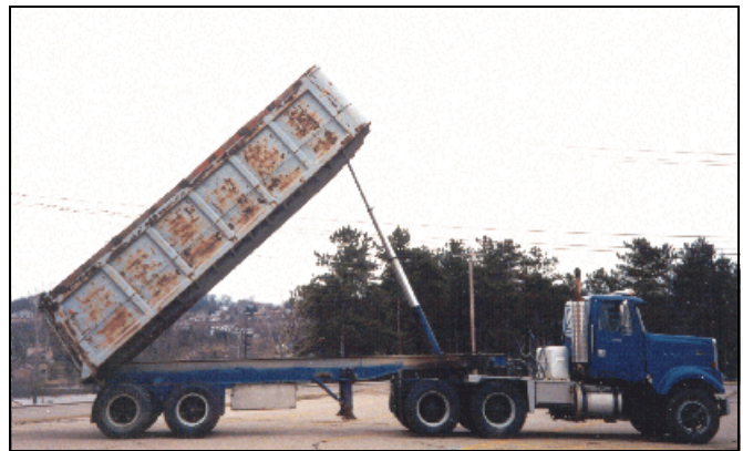
Fig. 2. 20.9 tonne (23 short ton) tractor-trailer dump truck used in experiments.

2) On the trucks, a shunt was placed from the dump bed to the truck frame, and on the cranes, between the base section of the boom and the main boom pivot supports on the turntable. Except as noted in results, the shunt was a 91 cm (36 in) piece of #2/0 AWG stranded copper cable, with clean, tight mechanical connections using C-clamps.