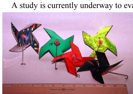
Figure 3. Prototype pinwheels to identify escapeways.

entry, at an average height of 2-m from the floor, and lower in lower seam mines. Depending on the configuration of the mine, the lifeline could be many kilometers in length. One manufacturer developed a directional lifeline shown in figure 2. It consists of standard spools containing 91-m of 0.64-cm polypropylene rope with directional (cone-shaped) orange indicators with green reflective tape installed at every 23-m interval. The tapered end of the cone should always point inby, so that escaping miners would never have to take their hand off the line. Due to the complexity of mine entries that contain crosscuts, manddoors, overcasts, etc., it is suggested that two directional indicators be mounted together on the lifeline approximately 2 to 3-m from a mandoor, etc. This procedure would alert personnel escaping in smoke-filled entries that an obstacle of some sort is nearby.