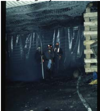
Figure 5. Underground smoke training exercise.

To better prepare miners to escape from underground smoke-filled environments, a series of smoke training exercises were developed and evaluated by NIOSH. Objectives of the exercises were to evaluate present escape methods, existing technology, and new technology that could be used for escape purposes, while giving the miners an opportunity to travel through smoke-filled entries at their mine. A non-toxic smoke generator is used to create a smoky atmosphere and the visibility can be varied from several meters to zero. The smoke generator is also an excellent device to evaluate the smoke leakage of mine stoppings and seals or to observe air currents. At the end of each training segment, miners completed a questionnaire, which included both forced-choice and open-ended questions, such as demographics (age, mining experiences, special training, etc), anxiety levels, usefulness of the exercise and technology, most visible colors seen in smoke, and underground firefighting experience.