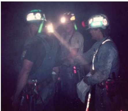
Figure 1. Chemical lightsticks attached to the back of miners

NIOSH attempted to address several issues raised by rescue team members that participated in the simulations. One of the main concerns of the rescue teams was identifying other team members and marking locations, such as crosscuts, brattice curtain, cribbing, and other items that may be found in the smoke-filled entries, or just maintaining a reference point. Chemical lightshapes (lightstick, light rope and light disc), a technology that has been around for years, were found to be a valuable tool for underground rescue teams. The lightshapes are nonflammable and not a source of ignition, and they are weatherproof, maintenance free, and nontoxic. To activate, just remove a lightshape from the package, bend, snap, and shake. Instantly, a source of light exists that can vary in intensity and duration. The brightest lightstick lasts 5-min and the least brightest, 12-hrs. The brightest lightstick is an excellent source of light to administer first aid in smoky environments. Team members assessed the cylindrical lightsticks during the simulations, both in white nontoxic smoke and black toxic smoke produced from conveyor-belt