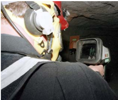
Figure 4. Rescue team member using a thermal imaging camera.

The Argus Thermal Imaging Camera can also see through smoke and darkness. Its spectral range is 8 to 14-microns. It is ergonomically designed for comfort and utility, is handheld, and has an angled viewfinder. Moreover, this TIC accommodates a variety of users' positions from standing to lying prone. In low coal exploration, the innovative design reduces potential neck strain and, when