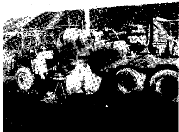
Figure 2.—Shrouding the dust collector to reduce respirable dust exposure to drill operators.