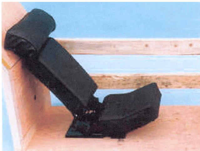
Figure 1.—Original seat.

As of October 1996 the safety and health research functions of the former U.S. Bureau of Mines are now located in the National Institute for Occupational Safety and Health (NIOSH).