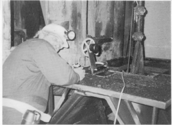
Figure 2.—Encoder mounted on shaft guide.

As of October 1996 the safety and health research functions of the former U.S. Bureau of Mines are now located in the National Institute for Occupational Safety and Health (NIOSH).