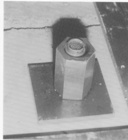
Instrumentation plug and installation head.