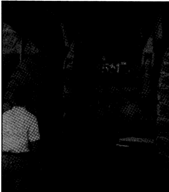
Figure 1.—Testing a radar system on the back of a Caterpillar 793 haulage truck.

Safety Vision, (713) 896-6600 or (949) 251-0040 The Truckdok, (520) 425-5009 Intec Video Systems, (949) 859-3800 or (724) 929-5500 Comserco, (760) 245-8462 Sunwest Supply, (520) 882-5717 RM Wilson Co., (304) 232-5860 Southwest Technology, Inc., (520) 402-0123