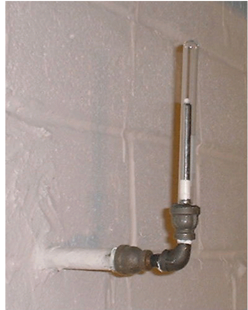
Figure 1.—Tire gauge installed on mine solid block seal.

Mention of any company name or product does not constitute endorsement by the National Institute for Occupational Safety and Health.