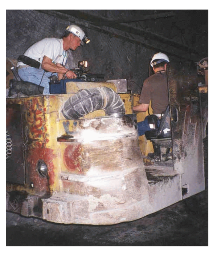
Figure 1.—Hazards In Motion.

Mention of any company name or product does not constitute endorsement by the National Institute for Occupational Safety and Health.