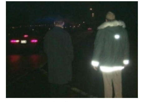
Iceland reflector on Navy arctic parka

Local Icelandic companies have also requested permission to use the design for their employees. The reflectors are distributed to new arrivals at NAS Keflavik during indoctrination training, as well as to schoolchildren and all new civilian employees. They are also available from the Safety Department Office.