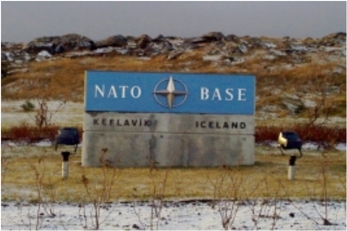
Main entrance, NAS Keflavik

workers' compensation costs since 1986. The command has never had a