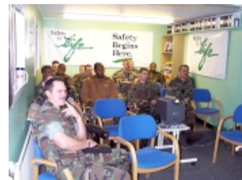
Public Works CB's attend NAVOSH training session

class of 20, organized by trade or occupation, discusses findings from the annual inspection and other pertinent safety topics. Training is provided in Icelandic and English, and an exam is given at the end of each training session. This new