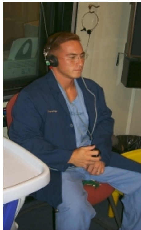
Audiometric testing of employee

http://192.101.124.40/Industrial/Default.htm