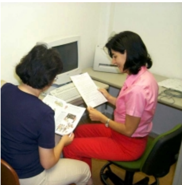
OHN answers employee's question on HCP refresher training

The new training guides and commercially available hearing conservation information are given to HCP employees to read while waiting for their annual audiometric tests. At the time results of annual audiometric testing are reviewed with each worker, an Occupational Health Nurse (OHN) also answers each worker's questions about the HCP refresher training. Employees and supervisors consider this discussion to be superior to merely watching HCP training videos. At the end of the question and answer session with an OHN, each HCP participant signs a form verifying that the HCP review was understood.