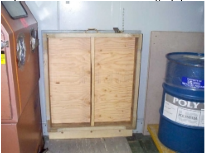
Space saving foldaway platform provides ergonomic comfort for blast cabinet workers

improvement. Even while sitting up perfectly straight, some workers could not