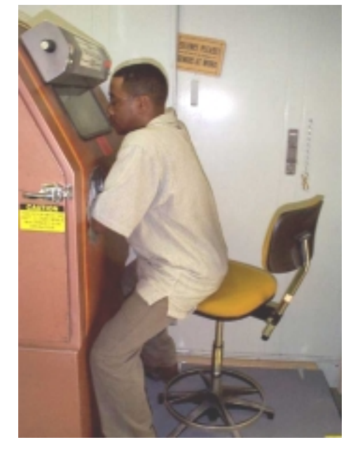
Adjustable chair left too little knee room and required the blaster to bend forward

The first attempt to make the workers more comfortable was to place an adjustable chair beside the blast cabinet. The chair did not leave the blaster enough knee room to get close enough to the blast cabinet to use the armholes without bending forward and reaching out for long periods. Blasters could turn their legs to one side to reduce the reach and sit up straighter, but this twisted posture was not an