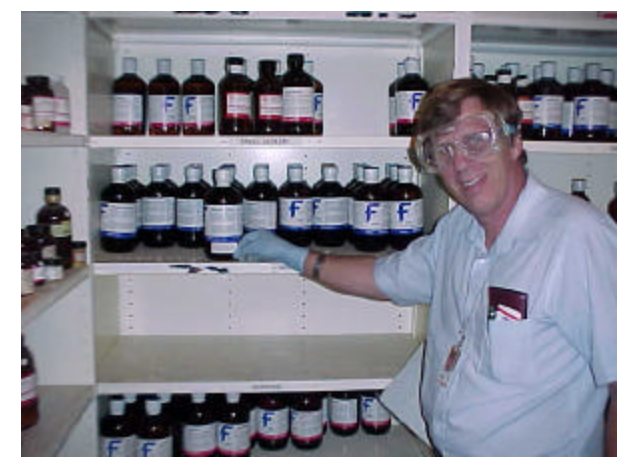
Numerous potentially hazardous chemicals are stored at R&D laboratories that may require analysis by an industrial hygienist

Some of the hazardous substances used in research and development (R&D) laboratories are regulated by the Occupational Safety and Health Administration (OSHA) or by Navy standards. In those cases, an industrial hygienist collects samples of air in the worker's breathing zone during the use of particular hazardous substances to determine, through chemical analyses. the concentration of the hazardous substances that the employee might breathe. There are also other health-hazardous substances. not yet specifically regulated by OSHA, which may cause cancer or birth