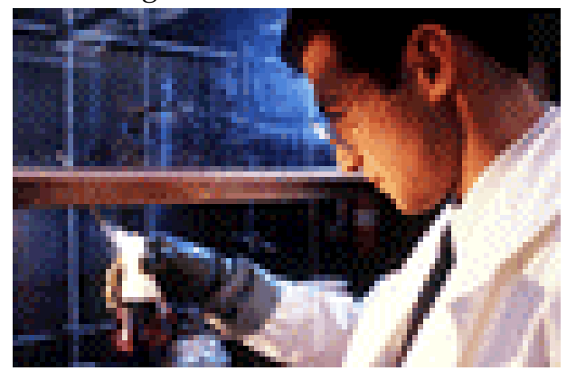
Timing of laboratory experiments can be unpredictale

Monitoring for airborne contaminants at R&D laboratories that the