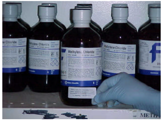
Self-sticking label serves as reminder to call the Industrial Hygiene Office for monitoring

hygiene monitoring prior to their use. As an example, the Chemistry Division at NRL has approximately 8,000 different chemicals in its inventory.