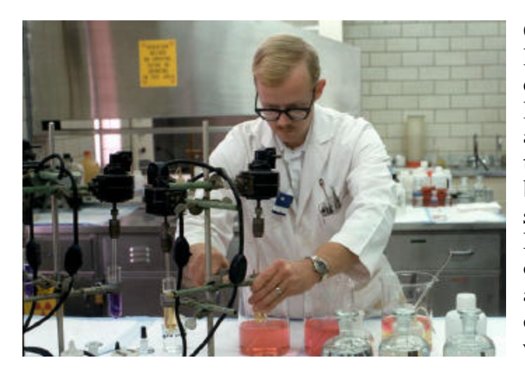
Researchers often work with chemicals that may emit airborne contaminants

Industrial hygiene is a scientific specialty that is dedicated to the prevention of occupational diseases and injuries through anticipation, recognition, evaluation, and control of exposure to chemical and physical hazards in the workplace.