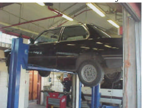
Inspected items include brakes, tires, lights, turn signals, seat belts, and horns

Italy. Cars that fail the AFI inspection may not be stored on