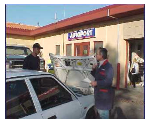
NASSIG Autoport mechanics, trained to Italian standards, use a safety checklist during vehicle inspections

passes for their vehicles. The NASSIG Autoport is a full-service gas