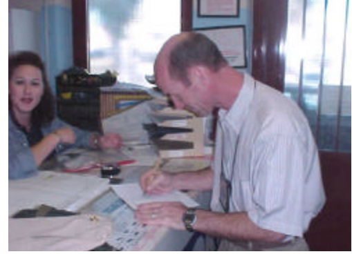
NASSIG employee checks in at Autoport for vehicle inspection

Privately owned automobiles must be inspected at the NASSIG Autoport before Department of Defense military or civilian employees at NASSIG can obtain AFI license plates or base passes for their vehicles. The NASSIG