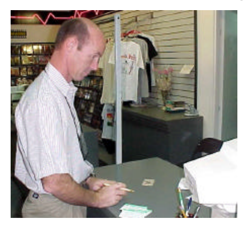
Owners of vehicles that pass inspection are entitled to buy discounted gasoline coupons for use on base

able to operate their vehicles on Italian roads, owners of vehicles that pass inspection receive authorization to buy gasoline coupons on base. Only American automobile owners with AFI license plates are authorized to buy gasoline on a U. S. military base in Italy. The coupons allow the purchase of gasoline at a discounted rate.