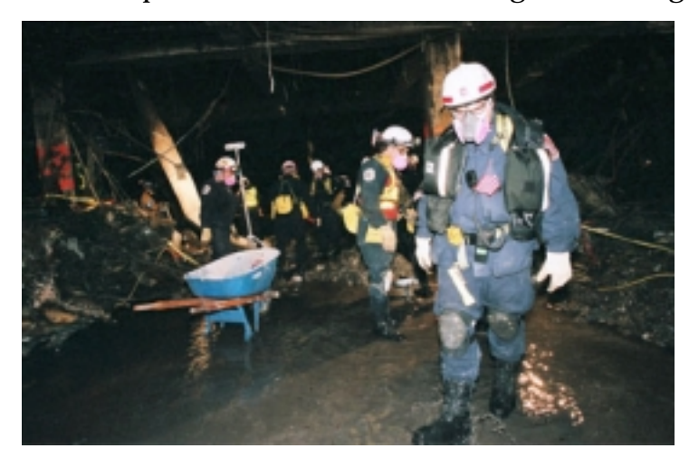
Many areas of clean up site lacked electrical power and lighting

Frequently, they had to climb over and around rubble, lopsided flooring, and collapsed sections of the damaged building.