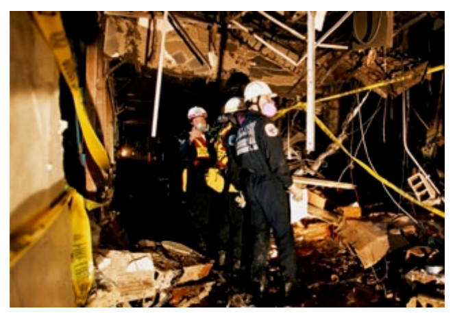
Pentagon terrorist attack crime scene

Because the site was a crime scene, and not a typical work environment,