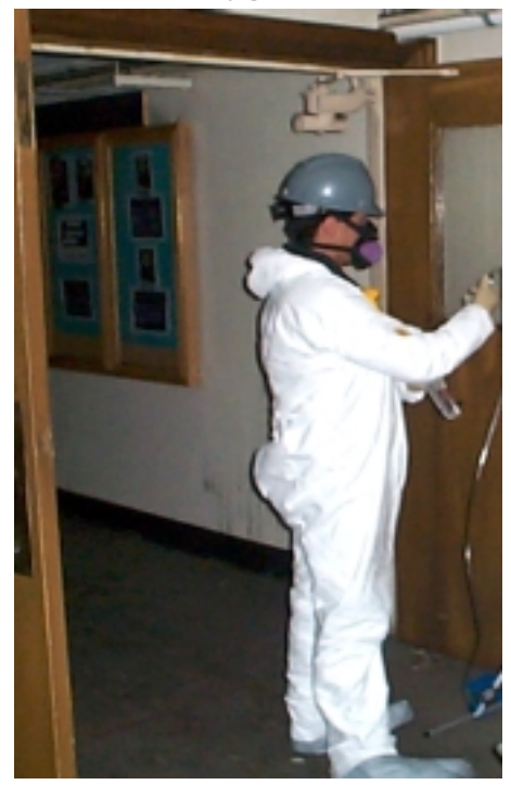
Navy industrial hygiene clearance sampling followed clean up of Pentagon after the terrorist attack

Industrial hygiene is the science that is dedicated to prevention of