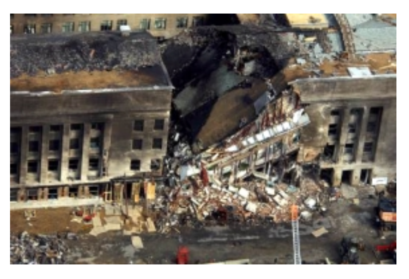
Aerial view of Pentagon September 11, 2001 crash scene

The September 11, 2001 terrorist attack on the Pentagon put a new spin on industrial hygiene clearance sampling. After the plane crash and fire destroyed part of the Pentagon's structure, health-hazardous residues and dusts were released into the