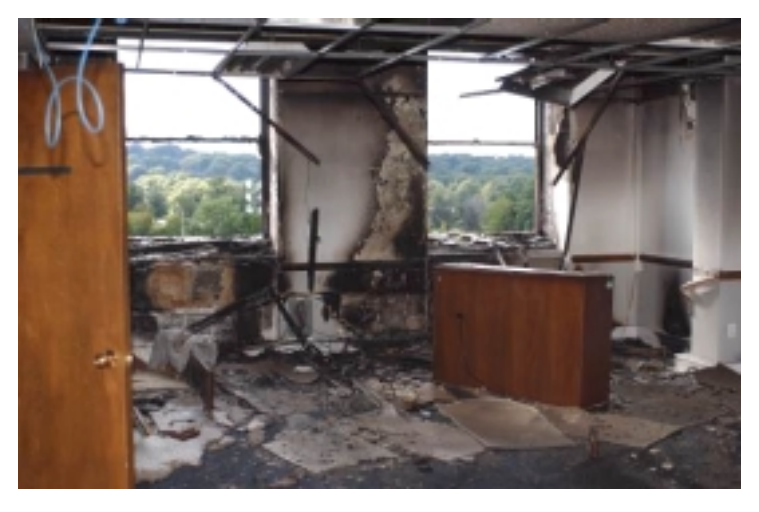
Pentagon office damaged in September 11, 2001 terrorist attack

samples and wipe samples in the crash zone and adjacent areas of the Pentagon to identify or rule out the presence of hazardous substances. They used calibrated air-sampling pumps to collect air samples and took wipe samples by wiping down surfaces on which potentially health-hazardous dusts or chemical residues had