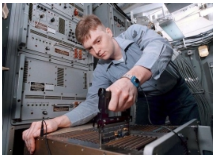
Performing maintenance on electronic communications equipment.

Naval Network Operations Command (NNOC) maintains and operates various types of equipment, such as transmitters and receivers, that the Navy uses to