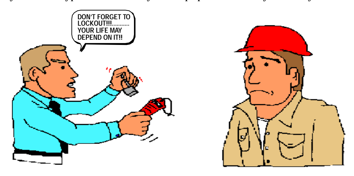
The U. S. Navy's policy for ships and shore facilities worldwide is to use Lockout/Tagout procedures to substantially eliminate the risk of personal injury to electricians and electrical maintenance technicians and others from unintentional activation of electrical energy during servicing or repair of the many different types of machinery and equipment used by the Navy.

Lockout is a procedure for locking out an energy source to eliminate the risk of electric shock or other injury due to the start-up or release of stored energy. To lock equipment out, an electrician or electrical maintenance technician disconnects switches, circuit breakers, or other energy-isolating mechanisms. Next, a device is placed over the circuit breaker to keep the electrical circuit from being turned on before the electrician or electrical maintenance technician finishes working on it. He or she then attaches a lock to the device so that the electrical system is completely locked out and cannot be turned on until each person who locked the system out removes his or her lock.