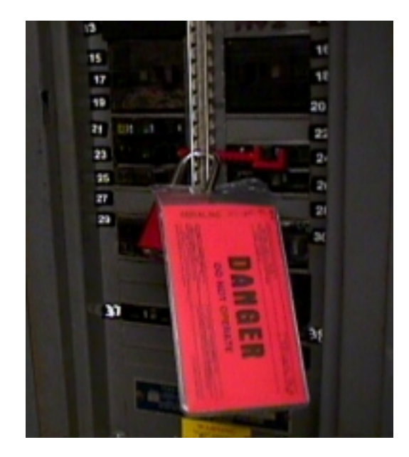
Danger tag warns against energizing electrical power panel.

Tagout involves placing an energy source in the safe position and attaching a red warning tag, as shown in the photo at right, to the switch or handle that controls the energy source. The tag warns against energizing the equipment. This is done to avoid the risk of electric shock or injury to anyone in contact with that equipment. Each tag identifies a person working on the tagged out equipment. Only the person who is specifically identified on the tag is authorized to remove that tag and reenergize the equipment. This Tagout procedure is not entirely foolproof; it does not provide the same degree of protection as a lock. The Occupational Safety and Health Administration (OSHA) has determined that Tagout alone may not be adequate to protect maintenance or