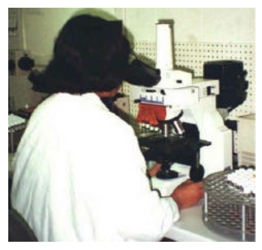
Adjustable microscope controls allow users to work comfortably.

Many features on the older microscope were not flexible, so a technician had to bend and twist his or her body to use the microscope. The new microscopes have a lower stage (the