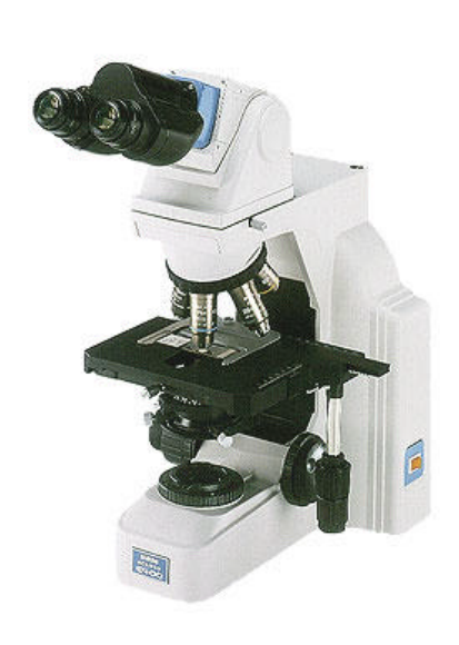
Ergonomic microscope can be adjusted to suit each technician.

flat surface that holds the slide) than conventional models so that oculars, or eyepieces, are at the technician's eye-level. The microscope's observation tube tilts so that technicians can either stand or sit comfortably while using the microscope. These adjustable features accommodate workers of different heights so that all can work in comfortable, ergonomically correct postures.