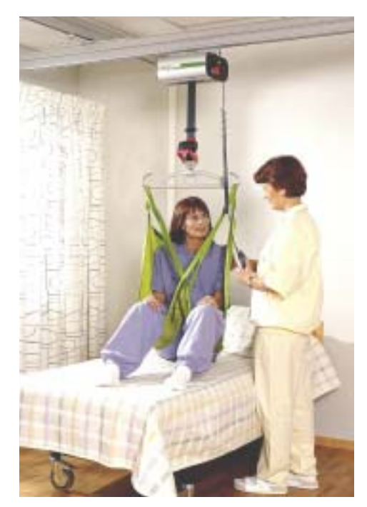
Ceiling Lift supports patient's weight while caregiver controls lift without risk of back injury

NAVFACENGCOM asked the NNMC nursing staff to evaluate two varieties of