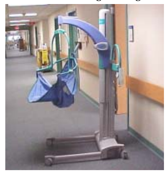
Portable Patient Lift in hospital corridor

Naval Facilities Engineering Command (NAVFACENGCOM) assessed ergonomic