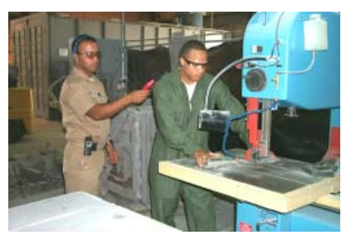
Industrial Hygiene Officer measuring sound pressure level generated by equipment in a work environment

The mission of the Navy Environmental Health Center (NEHC) is to support Navy and Marine Corps readiness goals through leadership in the prevention of