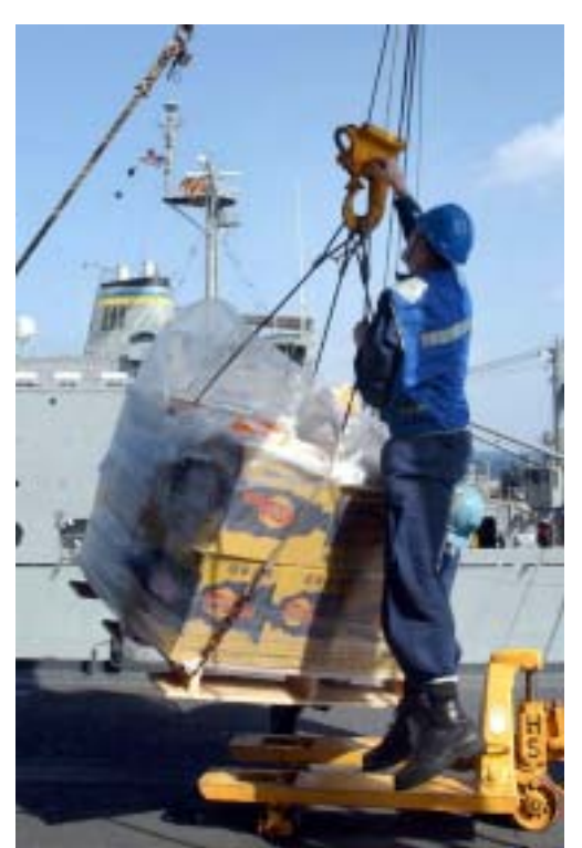
Boatswain's Mate disconnects a pallet during an underway replenishment. Training and supervision decrease the risk of injuries and cumulative trauma for sailors loading and unloading ships' supplies.

information on equipment maintenance and calibration, requirements for