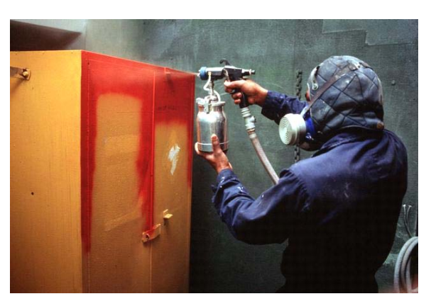
Manufacturing companies must supply Material Safety Data Sheets on the chemical composition of their products and how to safely use them

Navy industrial hygienists review Material Safety Data Sheets (MSDSs), product labels, and manufacturing data to ascertain the composition of the hazardous materials used at each Naval activity. The principal source of this information is the MSDS, which each manufacturing company is required to develop for the hazardous materials they produce. MSDSs contain information on the chemical composition of the product along with first aid, fire-fighting, storage and toxicological information. Navy industrial hygienists are charged with reviewing this information to see if a