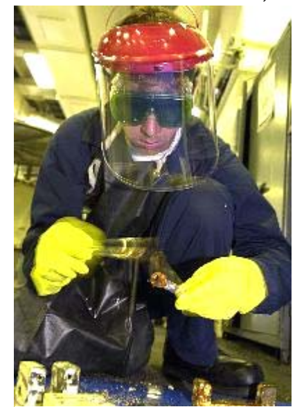
Industrial hygienists at NS Rota have more time to train workers on occupational safety and health matters

3) The added information allowed the HazMin Center to identify and tag products that contain potential carcinogens and/or reproductive hazards. These items were removed from the supply stream and "quarantined," i.e., placed in a separate storage area, and restricted from issue. The only way that a work center could access these quarantined materials was to provide a reference that stated that that specific material was required, by Military or Manufacturer's specification. By identifying and "quarantining" unwanted chemicals and using a review/approval process prior to purchasing new chemicals, the number of line items on NS Rota's inventory that