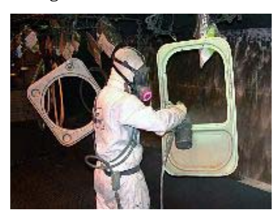
The number of potential reproductive hazards used at NS Rota have been reduced by nearly 65%

As a result of Mr. Dyrdahl's vision to cross-reference the MSDS and AUL databases, NS Rota industrial hygienists are now armed with summary data on the kind, amount, and specific location of hazardous materials for every work site on the base. The resultant control over hazardous materials used at NS Rota has significantly reduced the types and amounts of potential carcinogens and reproductive hazards used by NS Rota personnel as well as increasing general awareness of less hazardous substances that can be used in NS Rota workplaces.