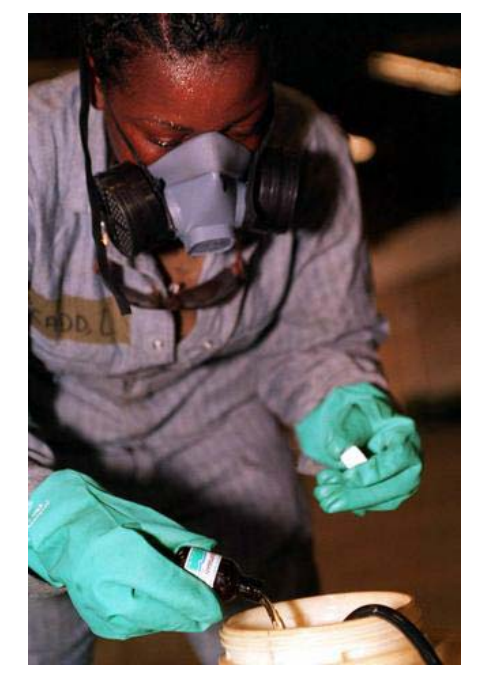
NS Rota industrial hygienists can use cross-referenced hazardous material databases for hazardous material risk assessments

Now each industrial hygienist can quickly review and assess which materials may present a risk of hazardous overexposure to workers. The computerized hazardous material cross-referencing system has truly transformed the process of hazardous material risk assessment at NS Rota. The system represents a tremendous improvement from the days when industrial hygienists had to search through chemical storage cabinets and shelves, write down all of the chemical components and the National Stock Numbers (NSNs) for each stored item, then search for each product on a microfiche system or contact the product suppliers to obtain MSDS sheets to help determine the health and safety