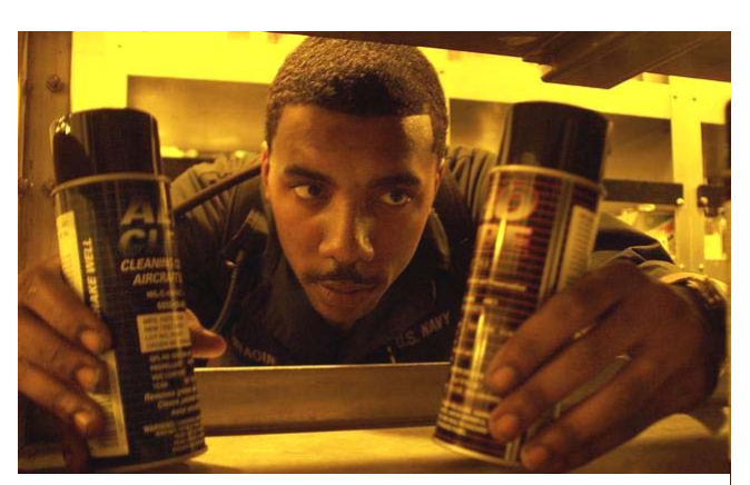
Hazardous Material database information is used to raise awareness on finding less hazardous substitutes

Certified Industrial Hygienist with Naval Hospital Rota's Industrial Hygiene Department, quickly recognized the power of cross-referencing these databases and cross-referencing MSDS information – specifically, Chemical Abstract Service (CAS) numbers (numbers that define and register particular chemicals) with National Stock Numbers (NSN) and specific Navy work center AULs. He recommended that NS Rota industrial hygienists request specific data fields be