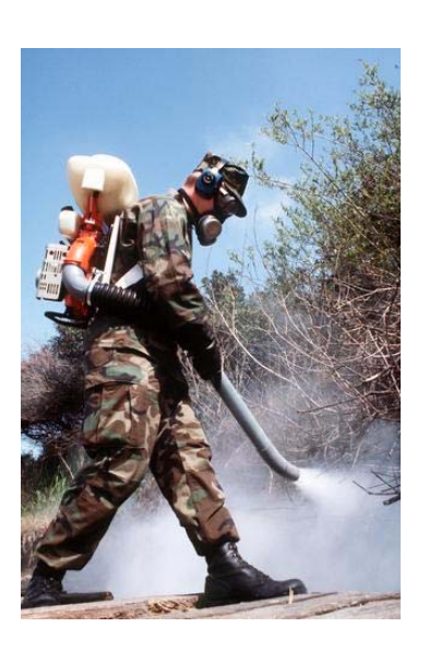
NS Rota has reduced the number of potential workplace carcinogens by 85%

contain potential carcinogens has been reduced from over 200 to just 32 items, nearly an 85% reduction. Most of the remaining items are specialty