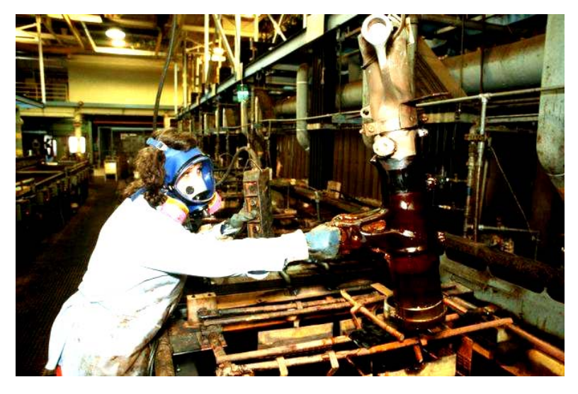
Workshops may store only a one- to two-week supply of hazardous material

stored and used on large Naval installations, some of which are akin to small cities. A major milestone for the Navy was the creation of the Hazardous Material Control & Management (HMC&M) Program, which requires consolidating purchasing operations for hazardous materials and, whenever possible, centralized storage of all hazardous material at Hazardous Material Minimization (HazMin) Centers. The Navy Supply Command's Consolidated Hazardous Material