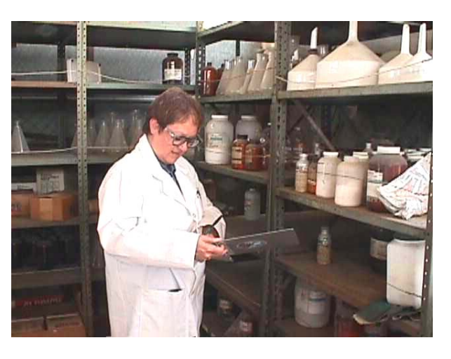
Industrial Hygienists analyze potentially hazardous materials used in Navy workplaces

The U. S. Navy employs industrial hygienists to help evaluate the types and amounts of hazardous materials used in Navy workplaces and potential exposures to Navy personnel who use these materials on the job. A hazardous material is any compound or mixture of compounds or chemicals that has physical or chemical properties that are considered hazardous, i.e. very acidic or basic, flammable. unusually toxic, etc. These determinations are made by several government agencies, including OSHA and EPA.