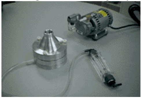
Anderson N-6 Viable Bioaerosol Sampler

access all areas needing preventive maintenance, replacement of HVAC air filters, cleaning of accessible HVAC components with a water and bleach solution, and repair of HVAC system mechanical components. The purchase of the specialized Anderson air sampler allowed the Rota Industrial Hygiene Department to conduct follow-up sampling for fungal contamination after each major abatement measure. The air samples were forwarded to LT Buffington at EPMU-2 to analyze for fungi. Repeat air sampling revealed a significant drop in airborne fungal colonies of up to 97% by the end of the abatement project.