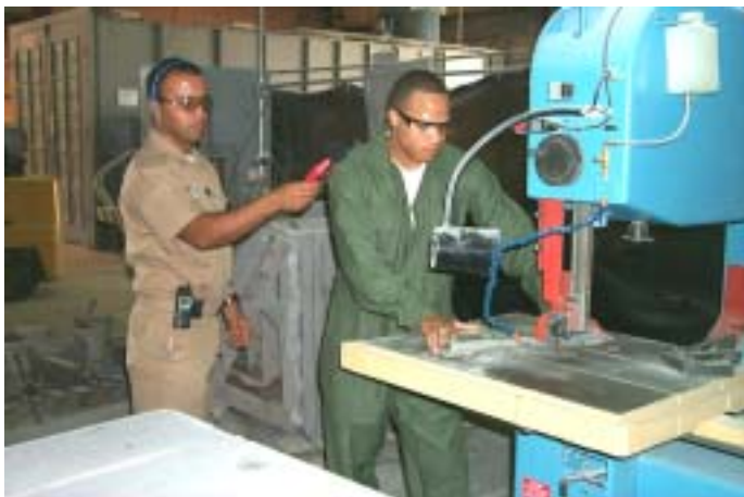
Industrial Hygiene Officer measuring sound pressure level generated by equipment in a work environment

The mission of the Navy Environmental Health Center (NEHC) is to support Navy and Marine Corps readiness goals through leadership in the prevention of disease and promotion of good health practices. NEHC's objectives include support of occupational health, environmental health, and preventive medicine services to sailors and marines stationed aboard Navy ships and at shore stations. Navy industrial hygienists are essential to accomplishing NEHC's mission and the Navy's disease prevention goals by preventing workplace hazards that may cause or contribute to work-related illnesses, injuries, disabilities, and even deaths.