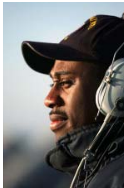
While standing watch, a Seaman wears hearing protection to prevent hearing loss due to overexposure to noise.

NEHC's Industrial Hygiene Directorate developed an Industrial Hygiene Field Operations Manual (IHFOM) to assist Navy industrial hygienists. The IHFOM has been a basic reference for Navy industrial hygienists since 1986. The manual assists industrial hygienists to complete their field surveys of potentially health hazardous work conditions and their survey reports. The IHFOM provides