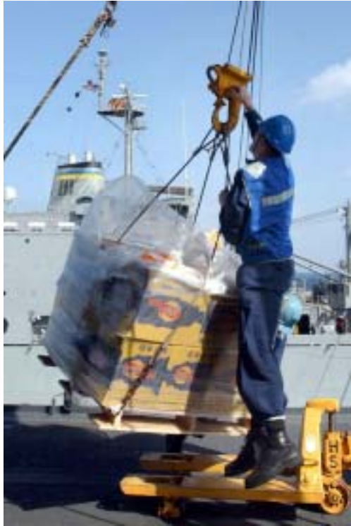
Boatswain's Mate disconnects a pallet during an underway replenishment. Training and supervision decrease the risk of injuries and cumulative trauma for sailors loading and unloading ships' supplies.

information on equipment maintenance and calibration, requirements for respiratory protection and other personal protective equipment, managing and containment of hazardous materials spills, and assessments of indoor air quality.