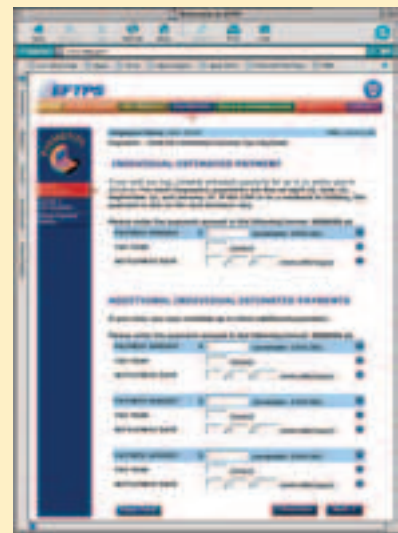
schedule a payment page

Don't worry about missing a payment because you're out of town or on vacation. And don't worry about remembering to make your payments on the right dates. EFTPS takes the worry out of paying your federal taxes on time.