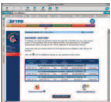
individual payment history page

With EFTPS-OnLine, you can logon and check all EFTPS payments you have made in the last 120 days*. Your payment history contains the type of payment, when it was made, how it was made, how much, when it was received, and when it settled. All this information is available to you online 24 hours a day, 7 days a week.