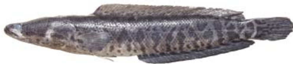
Channa argus

Snakeheads look very similar to the North American native Bowfin. Within the two genera, twenty-eight separate species are recognized; however, due to similar physical characteristics, these species are difficult to differentiate.