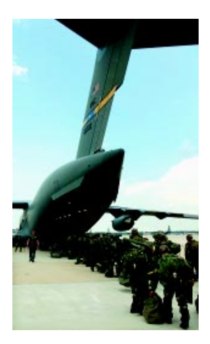
Paratroopers from the U.S. Army's 82nd Airborne and the Ukraine Department of Air Mobility line up to load into a C-17 Globemaster III at Fort Bragg preparing to jump in support of Peaceshield 2000.

Evidence of PfP's practical, on-the-ground success has been the way it has helped prepare Partners to become more militarily capable to participate in NATO-led peacekeeping operations, such as SFOR and KFOR. Partners have made important contributions to both of these operations, which in turn have reduced the burden on the United States and other Allies. This new pattern of Partner involvement, whereby Partners have gained more experience and capabilities through their involvement with PfP structures and operations, has set an important precedent for future NATO-led crisis response operations.