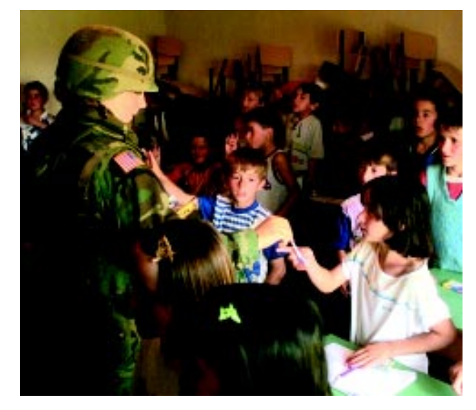
North Dakota Army National Guard soldier hands out pens and pencils to students in a schoolhouse in Kosovo.

efforts to complement military power through the application of more robust economic and political mechanisms. In addition, because the military aspects of intervention do not end when the shooting stops, our security approach to the region must also focus on further enhancing the ability of NATO Allies and Partners to assist with political rebuilding and the normalization of civil society and other functions.