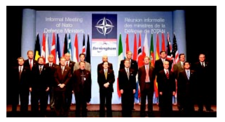
Meeting of NATO Defense Ministers at Birmingham, UK, October 2000.

Over the past decade, the threat of direct invasion of NATO territory has decreased significantly while other types of threats (including