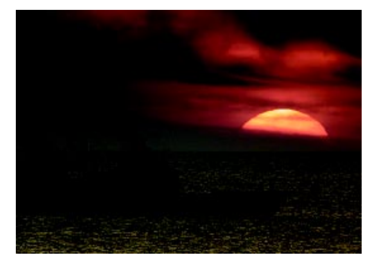
USS Normandy steams in the Atlantic while operating with the USS George Washington battle group.

To address the NBC weapons threat, the United States pursues a multi-dimensional strategy. Each component of our strategy depends, to varying degrees, on close cooperation with our transatlantic Allies and Partners, backed up by active bilateral and multilateral diplomatic efforts. For example: