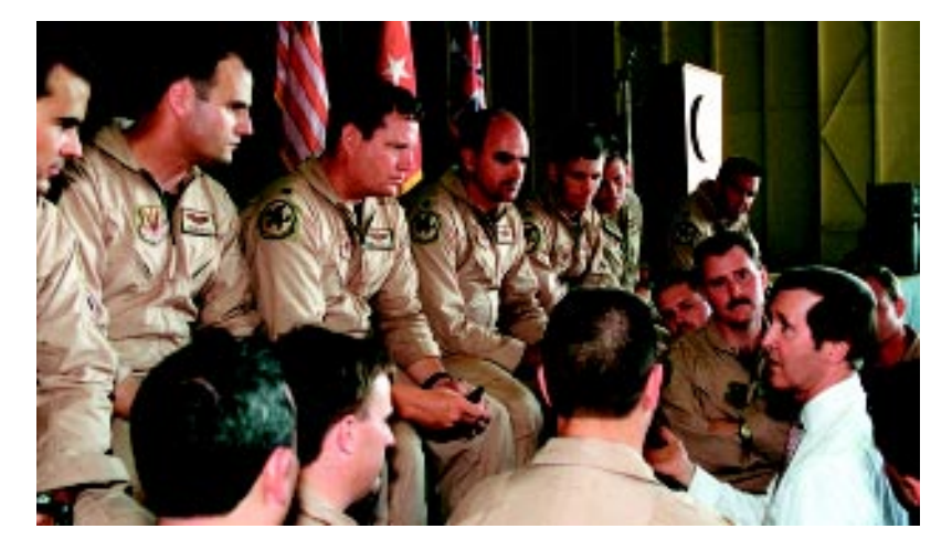
Secretary Cohen talks with U.S. Air Force F-16 Fighting Falcon pilots of the 120th Fighter Squadron.

The promotion of democracy and the protection of human rights remain core objectives of U.S. national security strategy. Strong and vibrant democracies already exist in much of Europe. Thus, our efforts