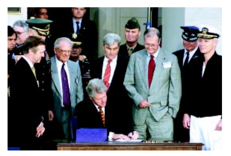
Defense officials and members of Congress surround President Clinton as he signs the National Defense Authorization Act FY 2000.

One explanation for this has been well understood since the founding of the Alliance: NATO's unity ultimately rests on the enlightened self-interest of each participating nation, but sovereign and democratic states do not necessarily have identical interests in every security domain. Differences in geography, history, political culture and, of course, in military capabilities still count—and they always will. The United States, which has contributed far more resources and capabilities to NATO than any other single Ally, cannot be expected to act as if these differences did not exist and did not influence our policies. Nor can we