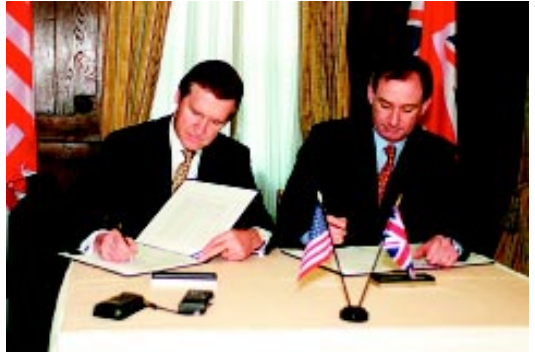
Secretary Cohen and British Secretary of State for Defense Geoffrey Hoon sign a Declaration of Principles for Defense Equipment and Industrial Cooperation in February 2000.

has only just begun, and we realize it will take time to complete. NATO can and should be flexible and generous in establishing such a relationship. Equally, the EU—a strong, confident, and vibrant institution that has accomplished so much in bringing Europeans toward an "ever closer union" in so many areas can and should be flexible and generous in its approach.