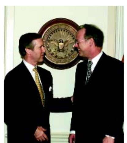
Multilateral and Bilateral Engagement

The Strategic Concept addresses future external adaptation of the Alliance. It underscores, for example, the importance of NATO's Partnerships with other countries in the Euro-Atlantic region and recognizes the need for consultation and joint action. As part of a broader effort to enhance stability and sustain reform throughout Europe, the Strategic Concept reaffirms that NATO's door remains open to future enlargement.