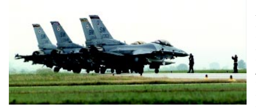
Four U.S. Air Force F-16 Fighting Falcons line up at the end of the runway at Aviano Air Base, Italy, for final checks before taking off on NATO Operation Allied Force missions in May 1999.

To ensure transatlantic security in the future, the United States and its Allies must improve defense capabilities in the fields most relevant to modern warfare. Operation Allied Force reinforced the fact that we need more deployable, sustainable, interoperable and flexible forces to engage effectively in a wide variety of situations. The United States is already moving to address these requirements, and we look to the rest of NATO to do its share. This effort will not be cost-free. All Allies have the responsibility to match their rhetoric with real resources. In many cases this will require increased defense budgets as well as smarter spending and pooling of resources.