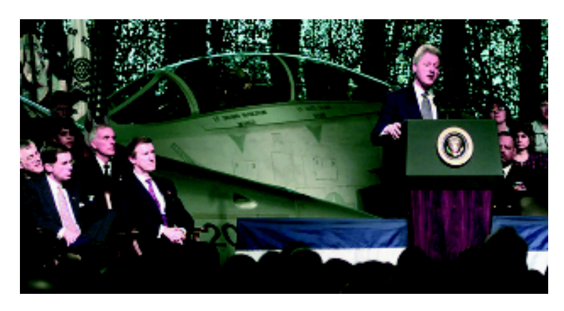
President Clinton thanks personnel deployed overseas in support of U.S. and NATO operations.

In the Euro-Atlantic region, we pursue our shape, respond, and prepare strategy through three mutually reinforcing layers of engagement centered on NATO, multilateral engagement with countries par-ticipating in NATO's Partnership for Peace (PfP) and members of the EU, and bilateral engagement with individual Allies and Partners. Within each layer of engagement, U.S. military forces stationed in Europe play a key role in advancing our security objectives.