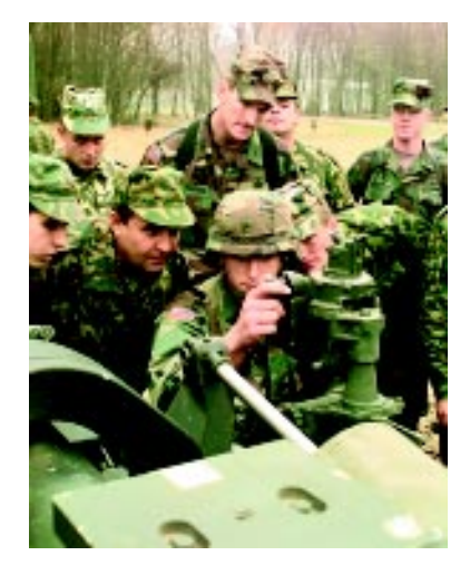
U.S. Army soldier explains the M-137A1 Panoramic Telescope to members of the Russian Separate Airborne Brigade at Camp Eagle, Bosnia.

While we strive to reach a common understanding with Russia, we must also underscore that it is in Russia's own national interest to broaden security-related cooperation with the United States, NATO and Partners. Here, as well, we have an excellent foundation upon which to build. For example, under the Expanded Threat Reduction Initiative, the United States is enhancing and enlarging existing programs that over the past eight years have helped the Russians to: deactivate thousands of nuclear warheads; destroy hundreds of missiles, bombers and ballistic missile submarines; improve security of nuclear weapons and materials at dozens of sites; prevent the proliferation of biological weapons and associated capabilities; begin safe destruction of the world's largest stocks of chemical weapons; and provide opportunities and inducements for thousands of former Soviet weapons scientists to participate in peaceful commercial and research activities. Several NATO and EU countries are engaged in related bilateral and multilateral efforts to assist Russia in dealing with the WMD-related legacy of the former Soviet Union.