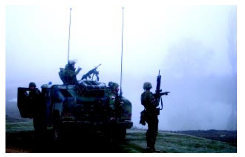
65th Military Police Company secures road from Stublina, Kosovo during the Operation Joint Guardian peacekeeping mission.

of mass destruction (WMD). There is no better way to shape a stable security environment and prevent new lines of division or confrontation in Europe than to reach out to Central and Eastern European states anxious to be integrated fully into the political, economic, and security structures of the transatlantic community. For the same reason, we need to build increasingly positive relations with the Russian Federation, Ukraine, and the other independent and distinctive states that emerged from the former Soviet Union.