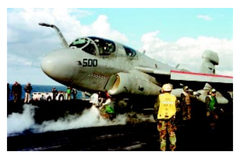
An EA-6B Prowler is prepared for launch off the USS Enterprise in the Adriatic Sea.

and an Alliance-wide consensus for action simply does not exist. We will do what we must to defend these interests, including, when necessary, using our military might unilaterally. In practice, however, this has occurred very rarely. We see a broad and growing spectrum of issues that are important to our security and where close cooperation with our Allies and Partners is a requirement—not an option. While some foreign policy commentators on both sides of the Atlantic seem quick to level charges of American "unilateralist" or "isolationist" tendencies, the facts almost never support such claims—and we should not be reluctant to point this out.