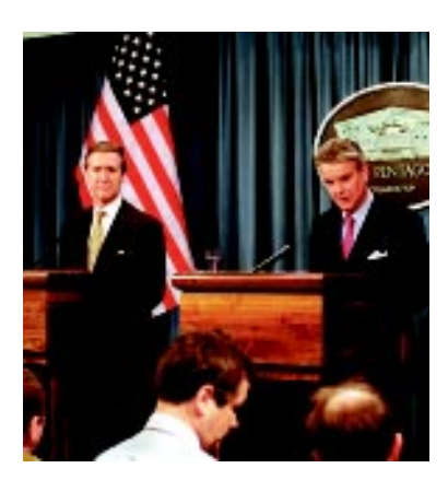
French Minister of Defense Alain Richard responds to a question during a joint press briefing with Secretary Cohen.

Military cooperation in pursuit of stability in the Gulf has continued since the liberation of Kuwait. For example, at least ten NATO