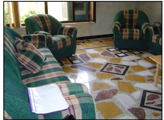
Newly furnished cultural center in northern Iraq