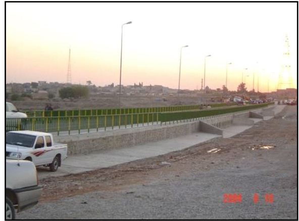
Bridge after reconstruction

Community Action Program -- Objectives include: promoting diverse, representative citizen participation in and among communities to identify, prioritize, and satisfy critical community needs, while utilizing local resources. CAP is implemented by five U.S. NGOs with offices in nine major Iraqi cities. Each NGO concentrates on one region in Iraq, which includes the north, south, southwest central, southeast central, and Baghdad regions.