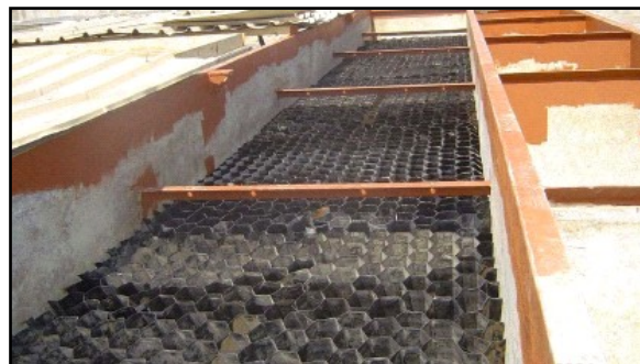
Tank after rehabilitation at a Basrah area water treatment plant