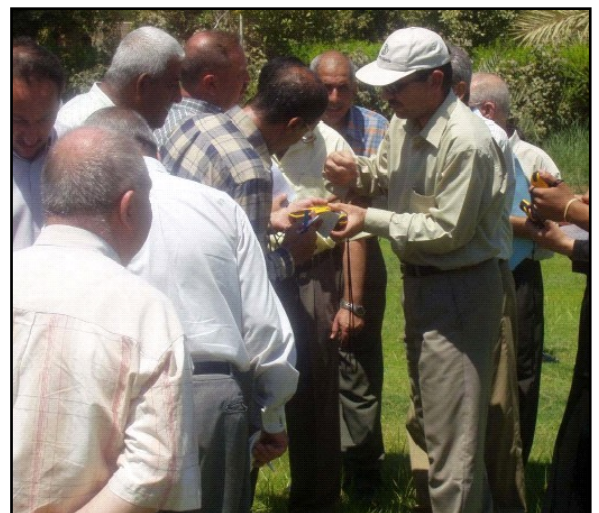
Employees from the State Board of Lands at a GPS demonstration