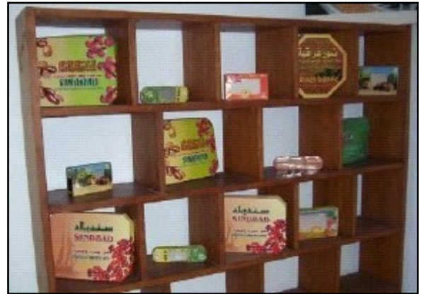
Iraq's packaged dates; this new initiative led by the MOA will examine Iraq's packaging systems to improve export competitiveness