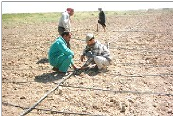
Installation of drip irrigation kits in Al Qadisyah