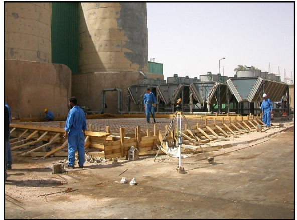
Workers installing foundation for a new heat exchanger