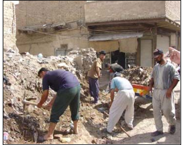
Workers and community members removing solid-waste from an empty lot in Babil Governorate