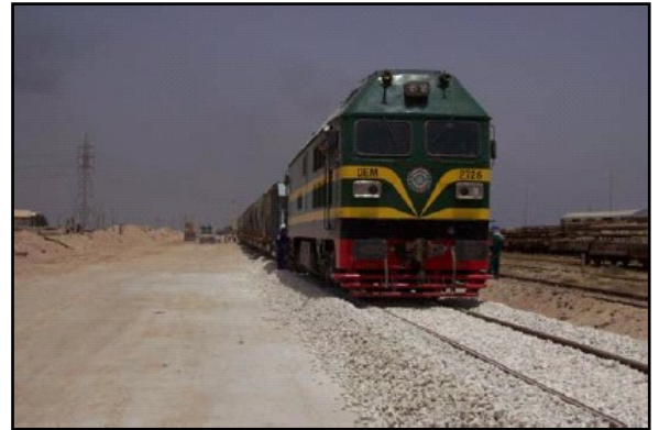
Train on track reconstructed with support from USAID