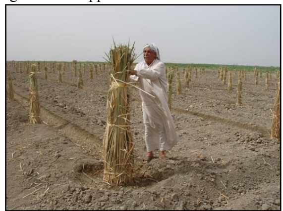
Marshland date palm offshoots -- Iraq is one of the largest world producers and exporters of dates. Date palm cultivation can provide long-term stable income for the marshland population