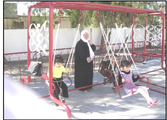
New kindergarten playground equipment in a Baghdad school. Repairs at the school will provide children with clean and safe education facilities