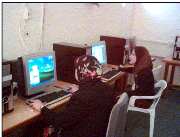
New computer center at the University of Dahuk's College of Agriculture.