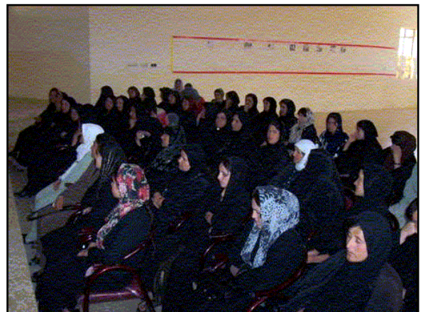
Participants of a health workshop by Al Amal Association