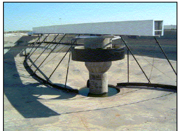
A clarifier at Ad Diwaniyah wastewater treatment plant.