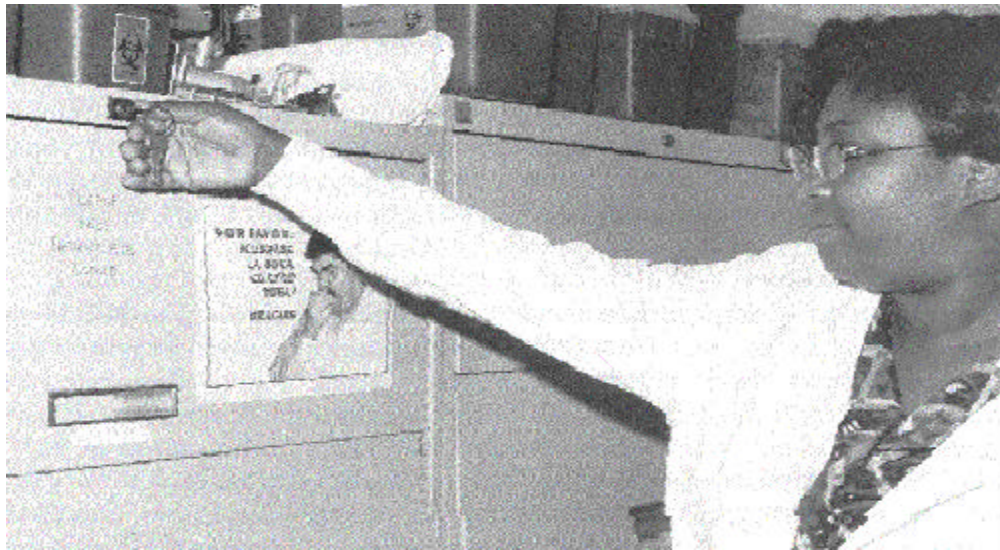
Figure 7.4 Closed, locked files.