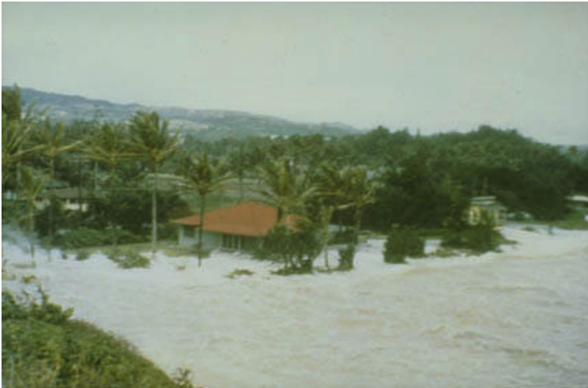
Second photo in a series of three sequential photos show the arrival of a major wave at Laie Point on the Island of Oahu, Hawaii.

The Hawaiian Islands suffered by far the greatest damage. Maximum runup and damage occurred at the northern part of the island of Kauai, near Haena point, where the tsunami waves reached heights of 16 m, almost twice the height of the 1946 tsunami. The waves destroyed bridges and sections of Kauai's highways were flooded. Houses were washed out and destroyed at Wainiha and Kalihiwai.