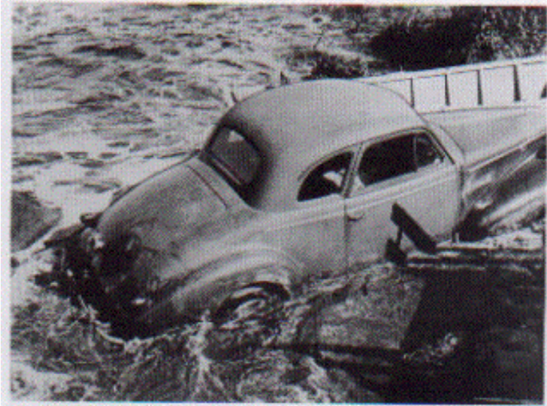
Figure 4.5 Automobile abandoned by its driver on Kamemehameha Highway at Waialua Bay, O'ahu, during the 1957 tsunami.

Automobile abandoned by its driver on Kamemehameha Highway at Waialua Bay, O'ahu, during the 1957 tsunami.