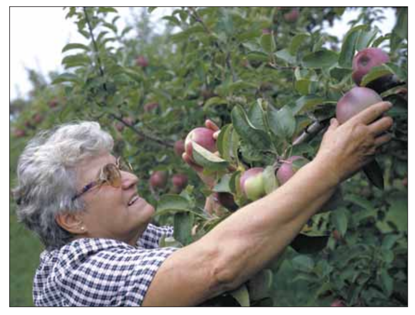
Among low-income elderly persons, the share of nonparticipants in the Food Stamp Program that reported being in excellent health was more than double the share of participants reporting this level of health.

An average of 1.7 million Americans age 60 and older received food stamps each month in 1999 and 2000. For households that included participants age 60 and older in 2000, average monthly benefits were $59, compared with average benefits of $158 for all food stamp households. The average benefit is lower for households with older Americans partly because of