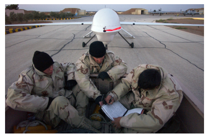
A Predator Unmanned Aerial Vehicle being towed to the runway in support of Operation Enduring Freedom.