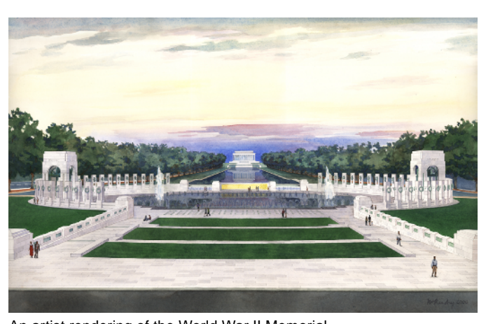
An artist rendering of the World War II Memorial.

Public Law 103-32 authorized a World War II Memorial on the National Mall between the Lincoln Memorial and the Washington Monument dedicated to the more than 400,000 who died, the 16 million who served in the Armed Forces, and the millions of supporters at home. Private contributions to this effort have been overwhelming. The President will dedicate the Memorial on Memorial Day weekend 2004. This project, undertaken by the American Battle Monuments Commission was completed on time and within budget and earned an effective rating by OMB's Program Assessment Rating Tool.