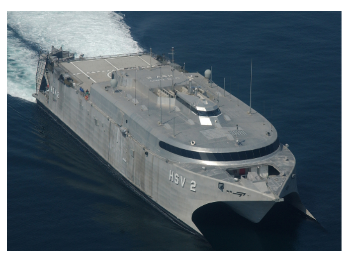
High speed sealift operates in the Persian Gulf.

To increase the mobility and response time of U.S. troops, the Army, Navy, and Marine Corps are currently experimenting with a commercially developed High Speed Vessel (HSV). Experimentation to date has shown that HSVs are able to move brigades of troops and their equipment at approximately twice the speed of any other sealift vessel. These ships are small enough to allow the use of shallow harbors, which means that troops can disembark from more ports. Beyond troop mobility, these platforms are reconfigurable and can be tailored to a wide variety of different missions. This concept is being employed by the Navy for its new ship class, the Littoral Combat Ship. The Budget assumes that the