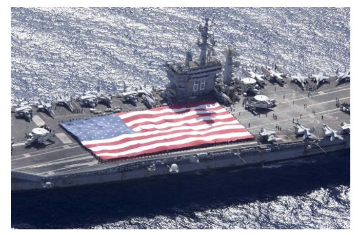
USS Nimitz returns home to San Diego after supporting Operation Iraqi Freedom.

As one example, the Budget supports the Navy's shift to a new operational concept, the Fleet Readiness Program (FRP). The FRP is designed to provide the Nation with more flexible forces that can be deployed to deter aggression or to defeat swiftly the efforts of our adversaries. The FRP will change the way the Navy trains, maintains and deploys its units. With this concept in place, the Navy will be able to deploy up to 6 of its 12 carrier groups and to have two more groups ready to follow on within 90 days. This is in contrast to the previous routine which kept only three carriers deployed for portions of the year. The FRP's tremendous increase in available combat power