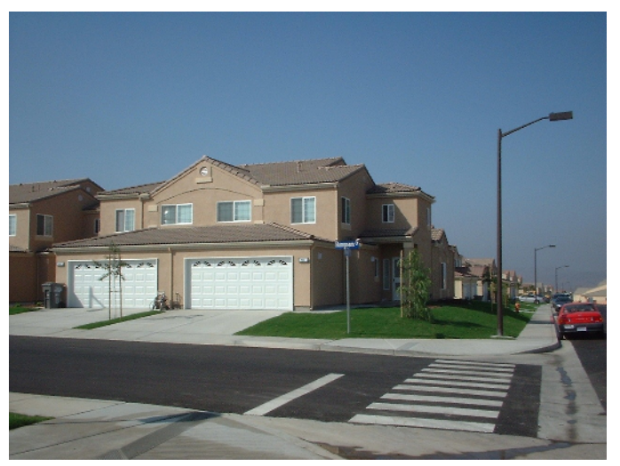
Family housing at Camp Pendleton, California.

One way to eliminate inadequate housing and to improve the quality of housing over the long-term is to privatize Government-owned family housing—letting the Government take advantage of private sector skills. One component of the President's housing initiative permits DOD to enter into business agreements with the private sector, whereby it draws on private sector expertise, leverages Government resources, and improves the