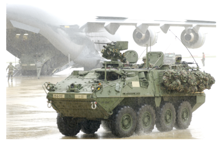
The Army's Stryker Infantry Carrier Vehicle.

Agile and Mobile Troops. Other transformation efforts are focused on the mobility and agility of ground forces. The Army reoriented its focus to be lighter and more mobile than its current tank and infantry fighting vehicle based units. The centerpiece of this change is the Future Combat Systems (FCS). FCS is designed to provide a rapidly deployable, highly mobile, lethal land force with the ability to fight on arrival in theater.