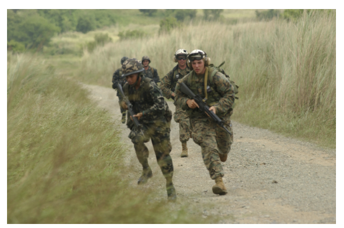
U.S. and Philippine Marines train together.

• The number of miles soldiers drive a tank in training improves their skills and readiness; the average tank crew will drive a tank nearly 858 miles in 2005 or 12 percent over the 2000 level.