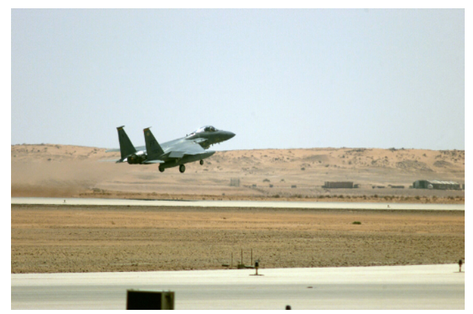
An F-15 departs Prince Sultan AB, Saudi Arabia.

Therefore, the global defense posture review will seek to reconfigure how and where U.S. capabilities are based around the world to make them rapidly deployable to meet the realities of the new strategic environment. In support of the initiative, DOD and the Department of State are currently soliciting views and participation from our friends, allies, and global partners in defining the options for the United States' posture. In addition, the Administration has begun, and will continue, to consult with the Congress. Based on the review and consultations, DOD will develop a plan that will be factored into the 2006 Budget. DOD will consider shifts from overseas locations to the United States in