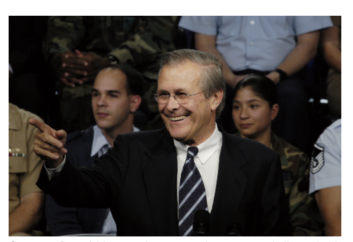
Secretary Rumsfeld responds to a question at a town hall meeting in the Pentagon.

Key Components: Department of the Army, Department of the Navy, Department of the Air Force, 15 defense agencies, and unified combatant commands.