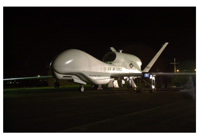
A Global Hawk Unmanned Aerial Vehicle receives a pre-flight test.

Unmanned Vehicles . The current operational Unmanned Aerial Vehicles (UAV), such as the Air Force Predator and Army Shadow have demonstrated tremendous capabilities in recent conflicts. While they have mainly been used in a reconnaissance role, the successful use of the Predator as a weapons platform is an early indicator that this technology offers profound opportunities to transform the way in which the United States will be able to conduct a wide array of combat and military support operations. The Department is consolidating and expanding its efforts to explore the potential of UAV technology. The Secretary of Defense has identified 49 goals for unmanned avi-