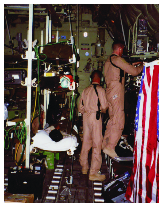
An aeromedical team evacuates soldiers injured in Iraq.

and responsiveness is only possible due to the Administration's multi-year investment in readiness. The FRP will give the President more flexibility to meet today's complex security challenges. The FRP is an excellent example of the Administration's efforts to transform the armed forces so that we fight even more effectively.