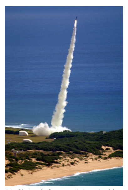
A ballistic missile target is launched from Hawaii as part of a test.

The President has steadfastly increased R&D investments in order to skip a generation of weapons and transform the military into the 21<sup>st</sup> Century fighting force it must become. From 2001 to 2004, the Department increased its R&D spending from $41.1 billion to $64.3 billion. The increases have supported a wide range of new systems including fighter aircraft, surface ships, submarines, the Army's Future Combat System, satellites, communications equipment, intelligence systems, and science and technology programs to accelerate the availability and capability of future generations of weapons. Furthermore, the level of investment in R&D will continue into the future, with $68.9 billion being proposed for 2005, a $27.8 billion increase over the 2001 appropriated level. In 2005, the Budget provides funding for many new defense systems, including the Joint Strike Fighter program, the Future Combat System, a new destroyer ship program, high capacity communications, and a number of intelligence systems.