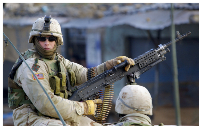
An Army Specialist mans a security position in Iraq.

The military's ability to achieve these strategic ends rests on four pillars of military readiness—all supported strongly in the 2005 Budget: