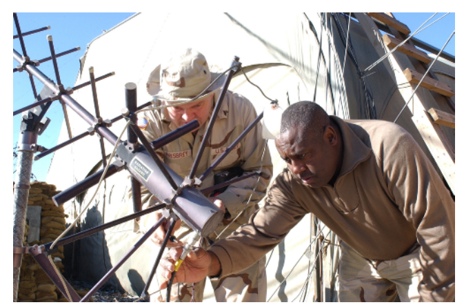
Two members of the Joint Task Force check a satellite antenna in Afghanistan.

Space . The Department continues to make progress in significant new, transformational The Space Based Radar space programs. program promises to provide near-continuous, all-weather surveillance on a global basis. DOD is also conducting an Operationally Responsive Spacelift demonstration program with the first flight planned in 2007. Rapid launch of satellites will become an essential element of future transformational space operations. Finally, continued development of laser communications satellites will provide dramatic new capabilities to supply more timely, secure information to combat forces. Communications to mobile forces, unlimited by current bandwidth restrictions, are critical to transformation of DOD combat operations.