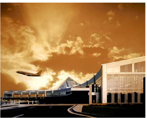
Newport News/Williamsburg International

The proposed Hampton Roads NSSC site is just five miles to Newport News/Williamsburg International Airport, twenty five miles to Norfolk International Airport and sixty miles to Richmond International Airport. Together, the three airports offer more then 475 daily non-stop /one stop flights to the other NASA centers and are served by all major airlines including low fare carriers Southwest, Airtran, and Independence Air. The site is also within easy ground travel distance by rail or car to Washington, D.C. In fact, the region is located within a day's drive of two-thirds of the nation's population.