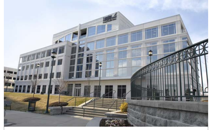
Langley Federal Credit Union Headquarters at City Center Completed Feb. 2004, Built in 275 days.

The proposed 132,000 square-foot facility will be tailored specifically to ensure that all goals of a high-efficiency, high -performance workplace are achieved