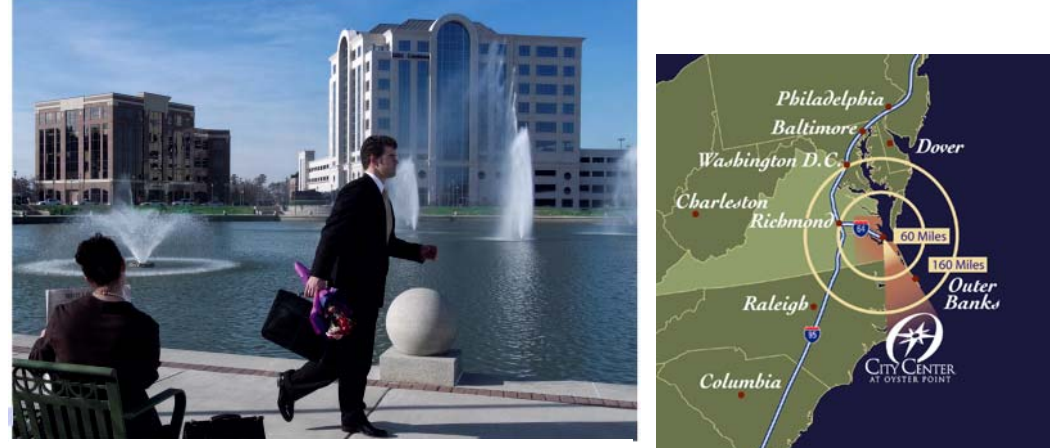
City Center at Oyster Point - Grand Fountain

The region features a young and stable workforce, and a vibrant regional economy that benefits from customized, college-based workforce training programs and thousands of highly skilled exiting military service members each year.