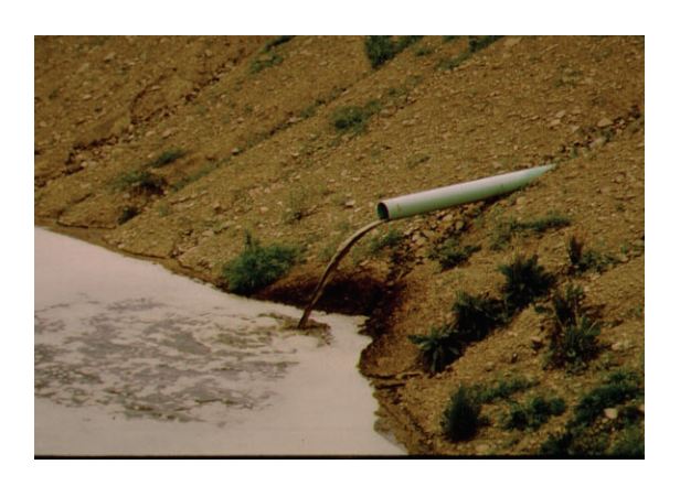
Piped discharges of barnyard and milkhouse wastewater could pollute surface water.

Example C: A 400-head beef cattle AFO, operated year-round, has a properly designed grassed waterway installed adjacent to the production area that transports runoff to an open field. There is no surface water in the area where the runoff is transported. Answer: No. While a properly designed grassed waterway is a man-made device, the discharge in this case does not reach a water of the United States.