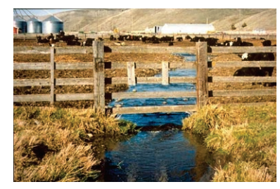
Uncontrolled manure that enters surface waters constitutes a point source discharge.