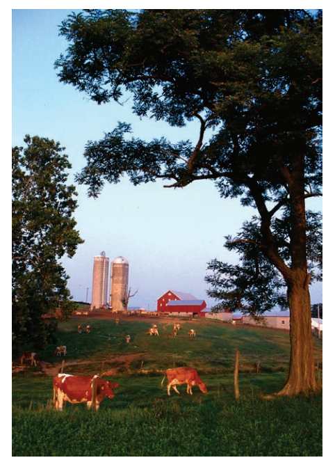
Waters of the United States should be protected from upslope animal confinement and manure storage areas.