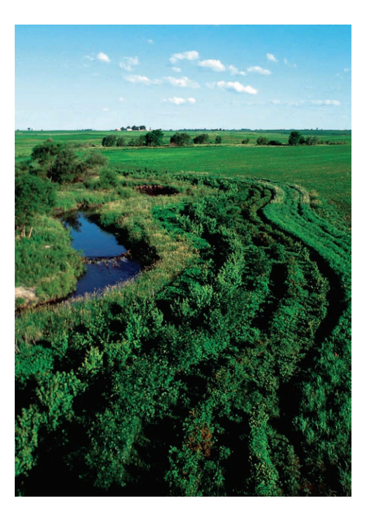
Grass filter strips can protect surface water from manure and effluent application.