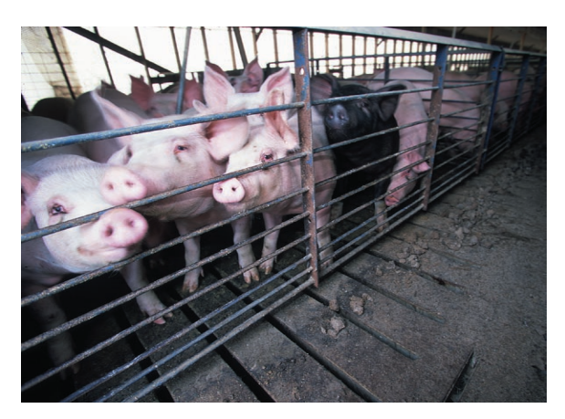
Slotted floors facilitate waste handling and the recycling of wastewater.