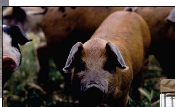
Swine AFOs could house animals of a single age class or mixed age classes (i.e., swine weighing both greater and less than 55 pounds).