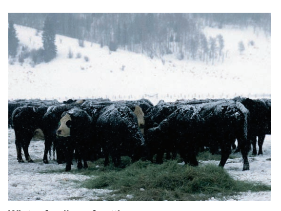
Winter feeding of cattle.