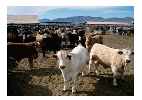
Beef cattle animal feeding operation.