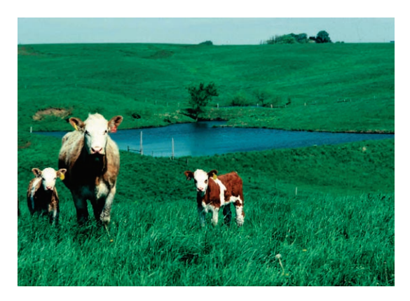
Beef cattle raised on pasture can be confined to smaller temporary confinement areas for part of the year.