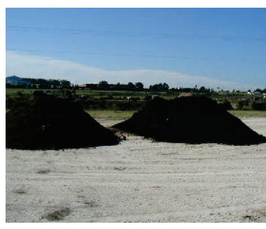
Runoff from unprotected stockpiles could pollute surface water.

• An AFO with 650 swine is crossed by a stream that originates outside of the facility and flows through its open lot, where the animals are confined, and continues on to connect with other waters of the United States beyond the facility. This facility would be a candidate for inspection and designation as a CAFO. Because the facility is a small AFO, it must meet the discharge criteria in 40 CFR 122.23(c)(3)(i) or (ii).