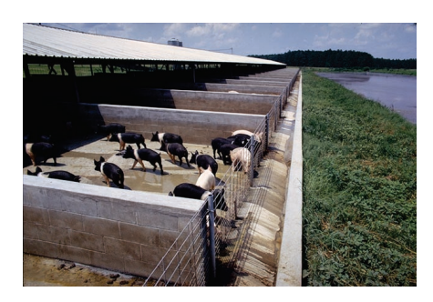
Hog parlor with a concrete floor and a conveyance that carries manure and wastewater to a lagoon.

Example C: A background yard (raises feeder cattle from time calves are weaned until they are on a finishing ration in the feedlot) has the capacity to hold 1,100 head of cattle. The facility operates year round (animals are confined 365 days a year) and has never confined more than 800 head at any one time. Answer: This operation meets the definition of an AFO because animals are confined for 45 days in a 12-month period. Because the operation does not confine 1,000 or more animals or cow/calves at any one time, the operation is not defined as a Large CAFO. The operation could be a Medium CAFO if it meets one of the two discharge criteria for the Medium CAFO category, or is designated as a CAFO by the permitting authority.