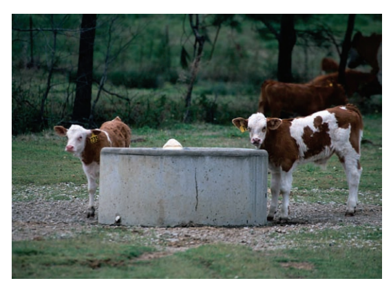
A water tank in a pasture combined with fencing keeps cattle out of critical riparian areas.