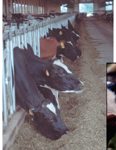
Dairy cattle animal feeding operation.

Example C: An operation confines for more than 45-days 250 beef cattle, 20 horses, and 22,000 chickens (does not use a liquid manure handling system). Answer: This operation does not meet the definition of a CAFO. The number of animals of any one animal type that are confined for 45-days in a 12-month period does not exceed the thresholds for a Large or Medium CAFO. Given that there are not sufficient animals confined, there is no need to determine whether the AFO meets one of the two discharge criteria to be defined as a Medium CAFO. However, this operation could still be designated as a CAFO if a determination is made by the appropriate authority that the operation is a significant contributor of pollutants to waters of the United States.