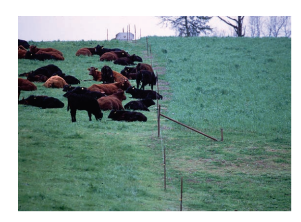
Pasture rotation provides adequate cover to prevent runoff to surface waters.