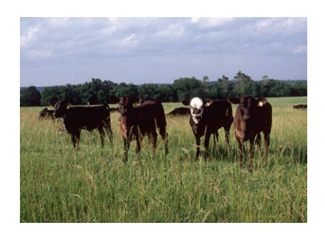
Calves on pasture.