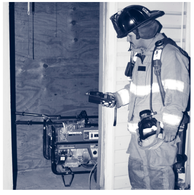
FIGURE 1. A firefighter uses a portable meter to measure the carbon monoxide (CO) level after CO exposure caused by a generator forced evacuation of an apartment building — Charlotte, North Carolina, 2003

Data were extracted from 1) medical records of patients with CO poisoning at all hospitals serving Mecklenburg County, 2) emergency medical service (EMS) and fire department reports, and 3) readings from handheld CO meters operated by members of the Charlotte Fire Department (Figure 1). Cases were included if they occurred from the time electric power was lost on December 4 until full restoration on December 13. Confirmed CO exposure was defined as an elevated CO level in the ambient air of a person's home (>50 ppm) or in a person's blood (carboxyhemoglobin level >10% in smokers