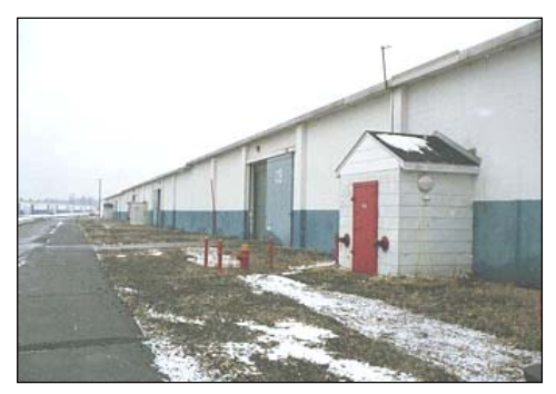
Typical Mercury Storage Warehouse

DNSC's mercury is currently stored in warehouses at three of its own depots and at a U.S. Department of Energy (DOE) site.