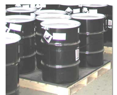
Steel Storage Drums on Pallet

Some of the mercury storage flasks were made in the 1940s and 1950s; the DNSC mercury stored at Y-12 was placed in new flasks in the mid-1970s. The flasks at the three DNSC depots are stored in 30-gal (114-1) steel drums for extra protection, called "overpacking." The DNSC mercury flasks at the DOE site are not stored in drums because these seamless flasks are relatively new and not as subject to leakage as older, welded flasks.