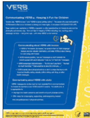
Visit the online version of this article to read the VERB Coolness Tip Sheet.

If tweens are inspired by a VERB commercial and motivated to be active, parents will more likely support their participation. Had the campaign’s strategy primarily focused on asking parents to encourage their children to be active, however, tweens might not have embraced VERB as their own brand. The campaign would have taken on a parenting agenda rather than becoming something for