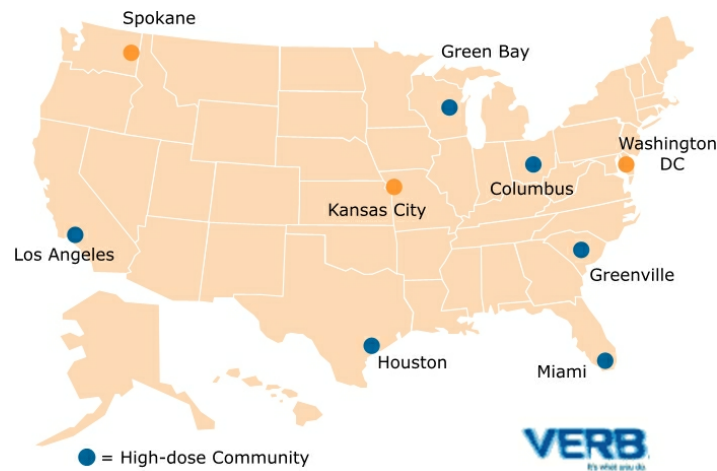
Nine Communities Receiving Extra Marketing Activities

and tweens and their parents must overcome many barriers to become physically active, including lack of transportation, safety concerns, cost, and perceived lack of time (2). Children report spending more than 4.5 hours daily watching television, playing video games, or using the computer; parents report their children’s screen time to be almost 6.5 hours daily (7). The VERB campaign’s goal is to win or gain a greater market share of time tweens spend on sedentary activities.