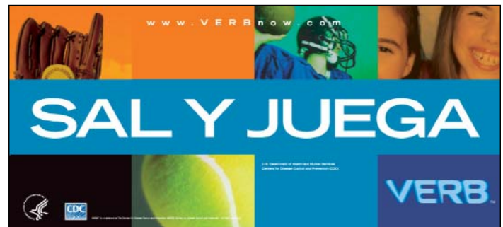
VERB posters "It's What You Do. Native Style" and "Sal y Juega."

Women's Tennis Association. These sports leagues will provide content for the VERBnow.com Web site for tweens, donate athlete-signed merchandise for prizes, and provide opportunities for VERB sponsorship of their grassroots sports clinics.