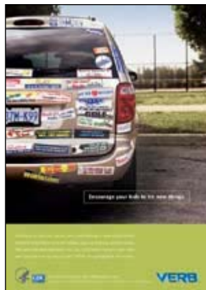
Visit the online version of this article to view the VERB “Bumper sticker” ad.

Advertising and marketing strategies. The VERB campaign strives for high brand awareness and affinity among tweens. The theory is that when tweens are positively bonded with VERB, they will be more receptive to messages about physical activity. In the first year of VERB, marketing efforts were dedicated to creating and introducing the VERB brand to tweens. As a previously nonexistent brand, VERB initially had no value to tweens. To sell VERB successfully to tweens as “their brand for having fun,” the campaign associates itself with popular kids’ brands, athletes, and celebrities, and activities and products that are cool, fun, and motivating.