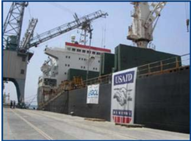
Over 3.8 million cubic meters of mud – the size of a football field 23 stories high – have been dredged from the Umm Qasr port channel. Humanitarian relief shipments, along with commercial traffic, are now able to enter the port to provide much needed relief and stimulate economic activity.