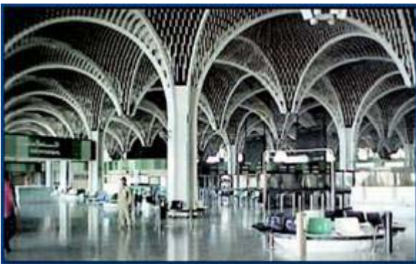
Terminal C at Baghdad International Airport has been refurbished and repaired as part of a $17.5 million project to rebuild Iraqi airports in Baghdad, Basrah and Mosul. The airport has the capacity to handle 7.5 million passengers a day.