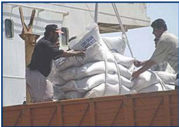
Iraqi workers are unloading humanitarian relief food that will be transported from the port at Umm Qasr, along the rehabilitated section of the railroad.