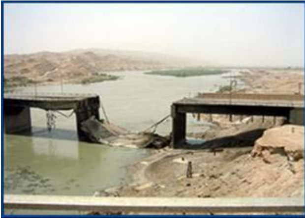
One of many sites in Iraq. Repairs have begun on the damaged Khazir River bridge on the route from Mosul to Kirkuk and on the Al Mat and Tikrit bridges as well.