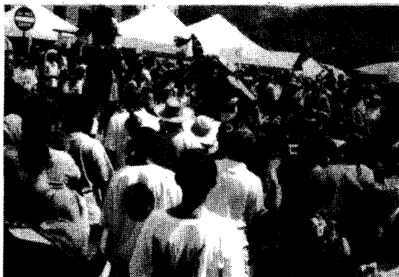
The crowd gathers to enjoy the spectacular sites and sound of the Goombay 2000 parade

The sights and scenes of Goombay were spectacular. Some 100+ vendors lined the streets of historic Eagle and Market Streets with their kiosks full of sundry souvenirs and every type of island food imaginable. Here you found the finest fritters, sizzling fried alligator meat, steamed veggies, authentic Bahamian food, clothing,