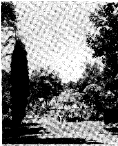
Photo #2 (After): Bent Creek headquarters campus after clearcutting beetle- killed shortleaf pines.

The rest of the story on the squirrel orphans: they're growing-up in an animal rescue facility maintained by the Animal Hospital of North Asheville. Thanks to the quick action of Brenda Minton , with the Forest Health unit also on the Bent Creek campus, the triplets probably missed only one feeding during their ride to the hospital. Upon returning to the home of their youth at Bent Creek, the orphans probably will not recognize the old neighborhood, which can deteriorate quickly when hungry pine beetles move in.