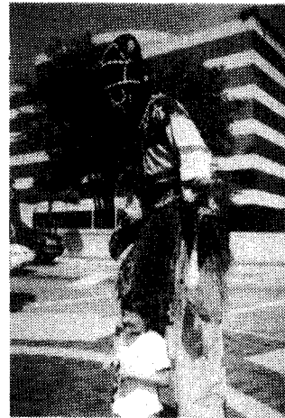
A curious parade fan poses for a picture with his new friend, a stilt walker from New Orleans, LA

A hearty "thank you" to everyone who contributed their time, energy, and expertise to make