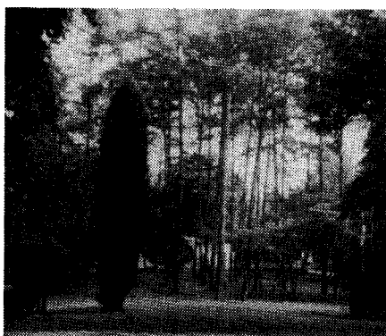
Photo #1 (Before): Bent Creek headquarters campus before pine beetle attack.