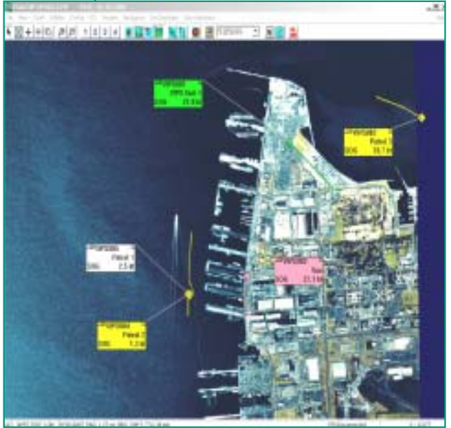
U.S. security operations and force protection units can track all VIPS-equipped vessels in real time on a geographic display.

The Center is field testing VIPS with the U.S. Navy and Coast Guard at U.S. ports; the system was deployed recently at Naval Station Norfolk and Boston Harbor. VIPS is scheduled for overseas deployment in summer 2003. (For previous articles on VIPS, see the Volpe Highlights issues dated March/April 2002 and November/December 2002.)