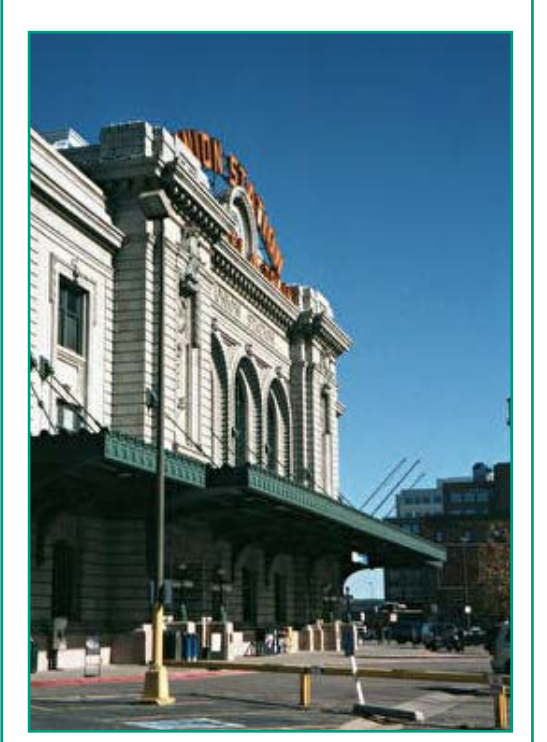
Rehabilitation of Union Station in Denver, Colorado, will increase transportation options and create an urban transportation hub.