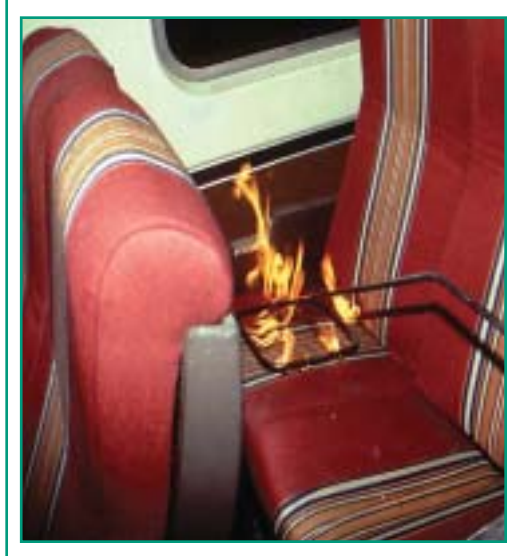
A full-scale, seat-fire test conducted on an Amtrak rail coach car, part of Volpe's support of DOT rail vehicle fire safety requirements.