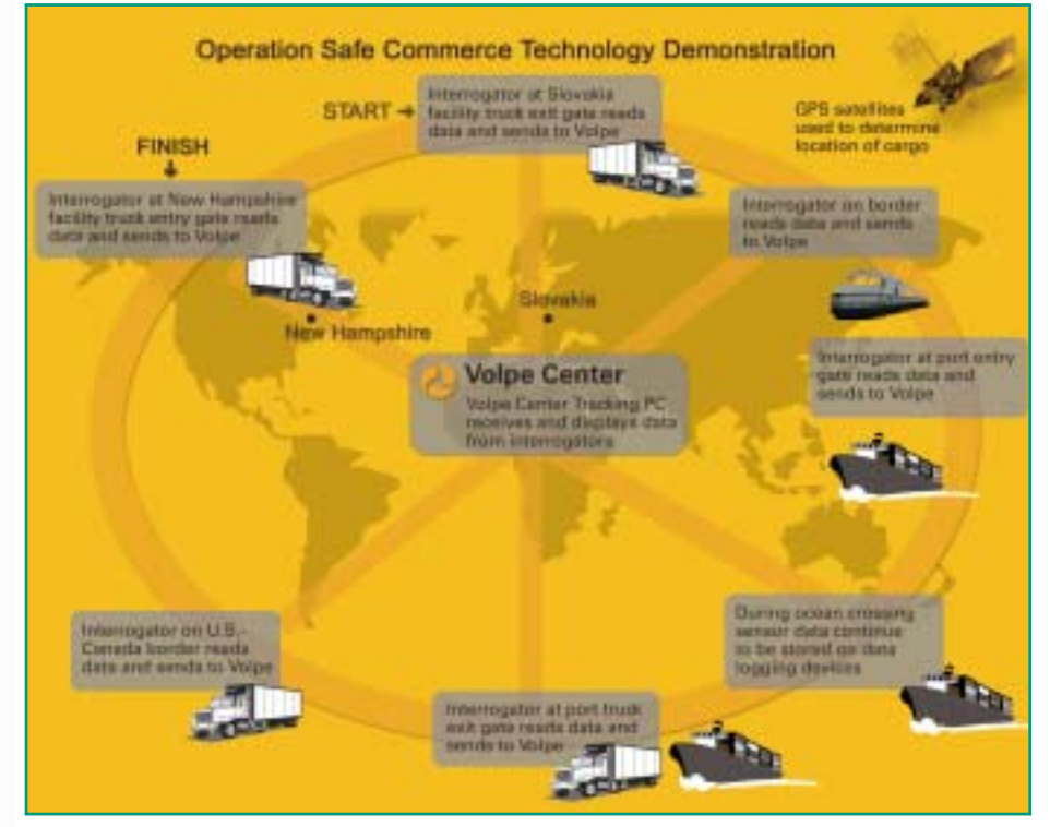
The Volpe Center manages the Entry Point Screening (EPS) Program, whose primary concern is protecting people and facilities against bombs carried by personnel, vehicles, vessels, mail, and cargo. The EPS projects include Operation Safe Commerce (above), for which Volpe performed an assessment of an entire multimodal, global supply chain and demonstrated tracking and sensing technologies. Data were captured by interrogation stations and transmitted to the Volpe Center.