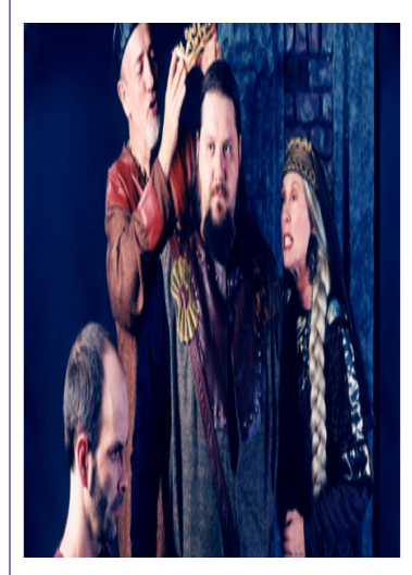
"Double, double, toil and trouble: fire and cauldron bubble." Macbeth comes to Finlay Park

Please contact the Concierge for more information or to purchase tickets.