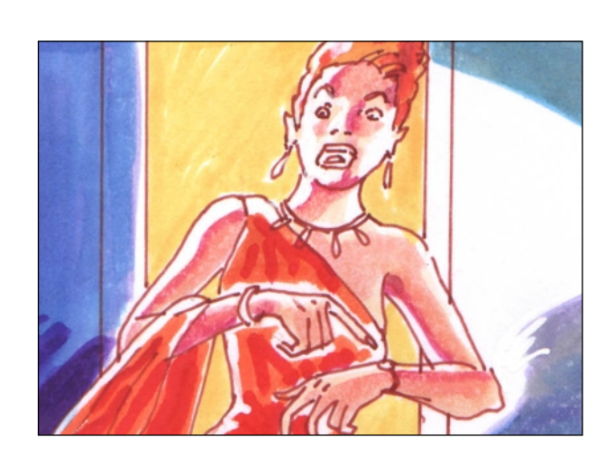
V.O. Some people

POINTS TO HER WATCH AND SAYS "TIME TO GO."