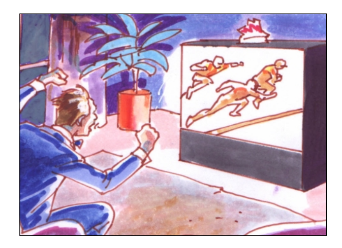
SFX: Sounds of football game and man cheering.

MAN IN TUXEDO INTENTLY WATCHING A FOOTBALL GAME IN HIS LIVING ROOM. 5 YARD LINE. ONE MINUTE LEFT IN GAME. TIE SCORE.