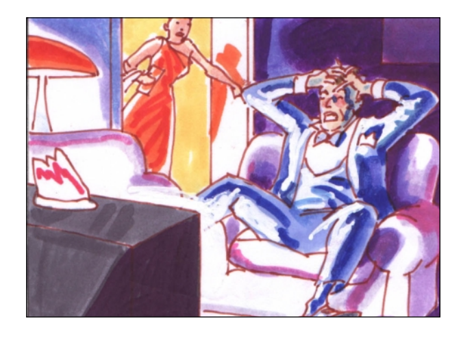
SFX: Groaning with sounds of football game in foreground.

POINTS TO HER WATCH AND SAYS "TIME TO GO."