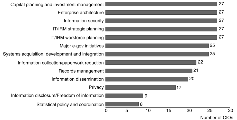
Figure 1: Number of CIOs Reporting That They Were Responsible for Each Information and Technology Management Area