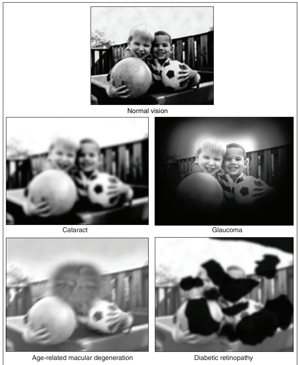
Figure 2: Vision and Vision Loss Due to Age-Related Eye Diseases