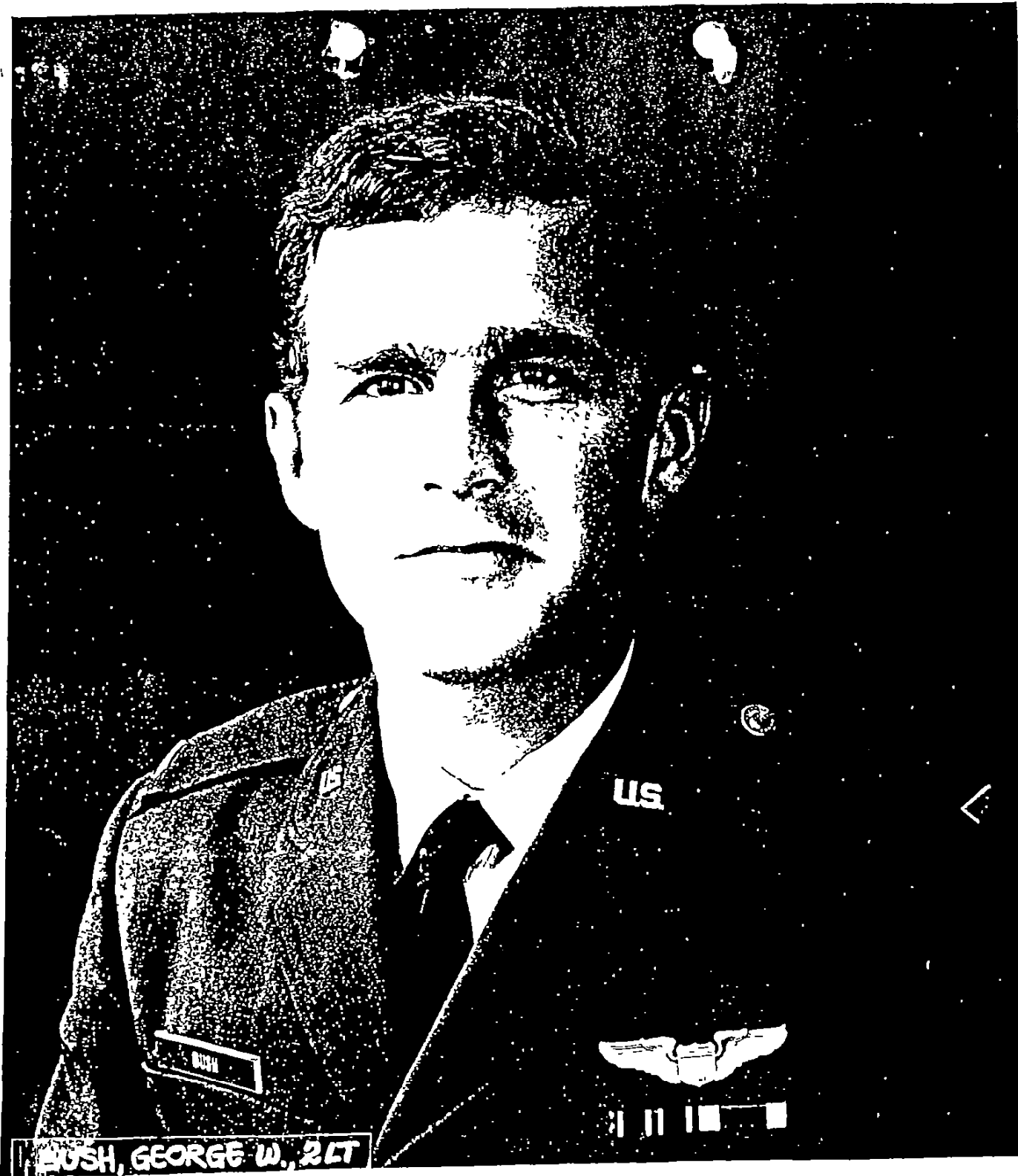
BUSH, GEORGE W., 2LT