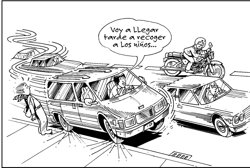
La madre demorada by The National Highway Traffic Safety Administration