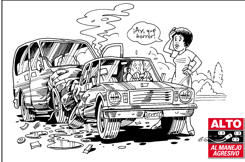
La madre demorada by The National Highway Traffic Safety Administration